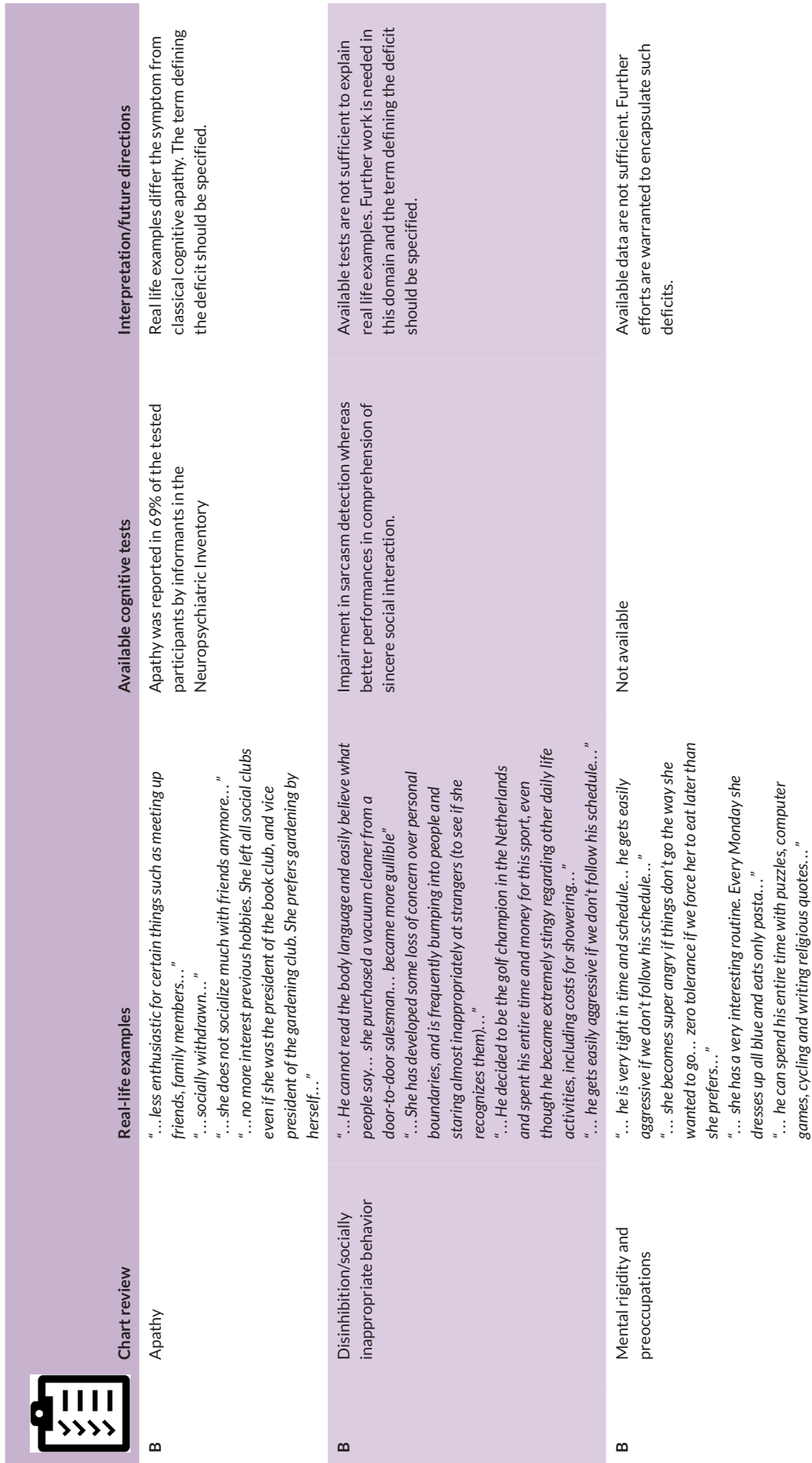
TABLE 4 (Continued)

Note: B: Symptom can be reported as a behavioral problem by the caregiver. L: Symptom can be reported as a language problem by the caregiver. M: Symptom can be reported as a memory problem by the caregiver.