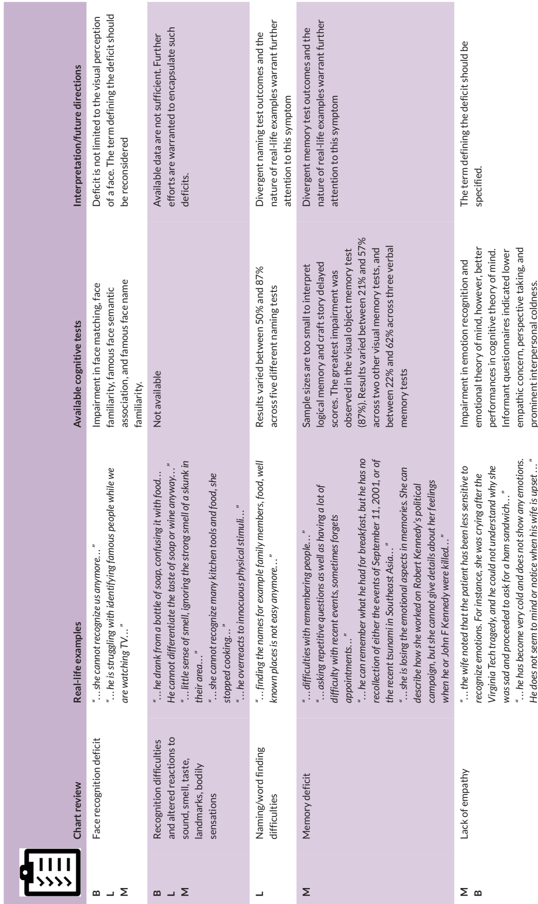
TABLE 4 Summary of the overall results and interpretation