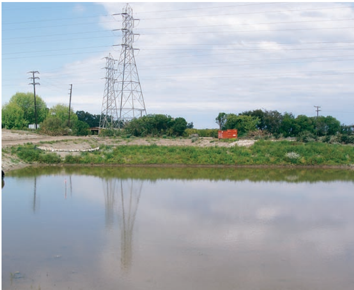
The unlined bottom of this detention basin allows captured runoff to percolate slowly into the ground. Soils and vegetation remove some contaminants from the water as it percolates or is taken up by plants.