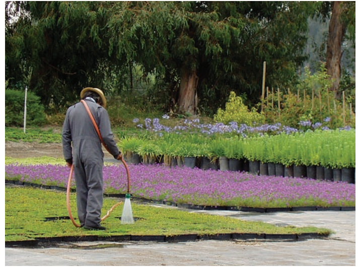
Hand-watering accounted for 18% of the production area in surveyed nurseries. Experienced personnel are necessary to avoid overwatering, and an on/off valve is recommended.

Runoff. The six questions in the runoff management category covered the collection and recycling of irrigation and storm-water runoff. Good management practices were not common, but their adoption increased from the initial survey to the resurvey in 2006. Pooled “yes” responses were only 10% in 2004, but increased significantly to 20% in 2006, with 43% “not applicable” (table 1).