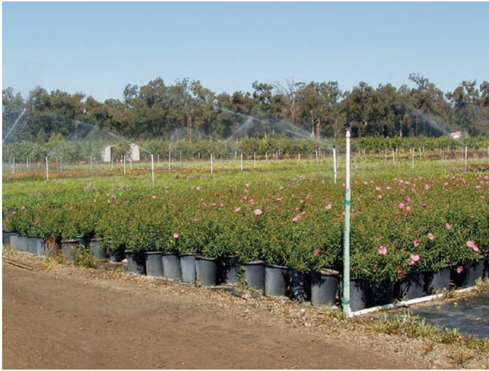
Overhead irrigation was used in 30% of the surveyed production area. If containers are not closely spaced, a significant portion of the applied water falls between containers and is wasted as runoff.