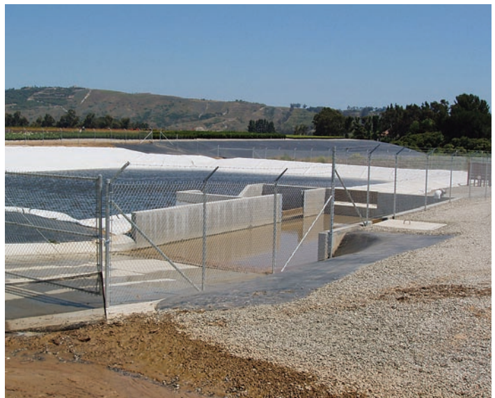
A retention basin allows runoff to be treated and recycled for use as irrigation water. Ventura County nurseries that recycle irrigation runoff significantly increased from 6% in 2004 to 14% in 2006.