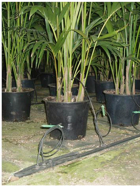
Drip tape, left, and microirrigation stakes, right, are low-volume irrigation methods. In Southern California, 51% of surveyed production areas employed a low-volume irrigation method. When properly scheduled, such methods are effective in preventing runoff.