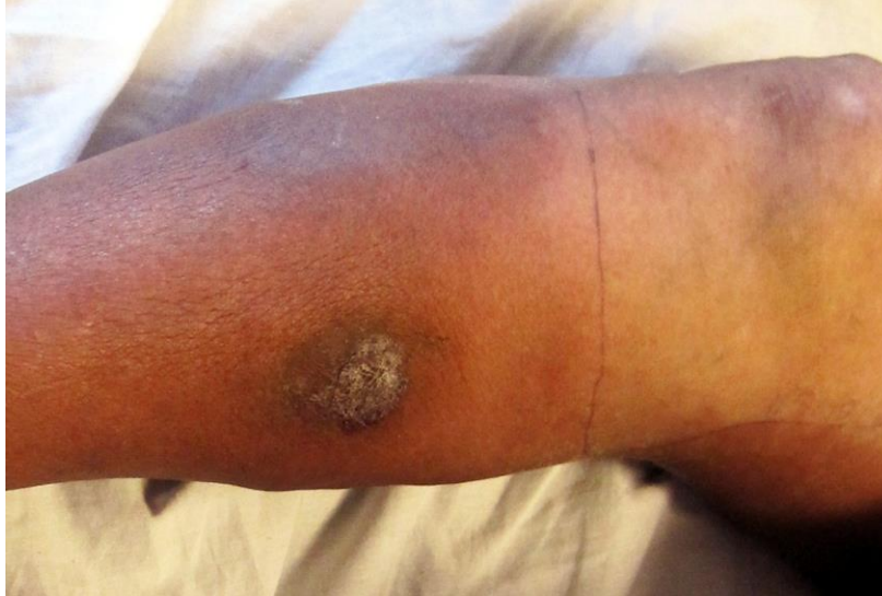
Figure1. An indurated verrucous plaque over the shin. Note the dusky erythema and surrounding edema from ankle to thigh with sparing of the anterior knee.

A 59-year-old man with focal segmental glomerulosclerosis, treated with prednisone and cyclosporine, was admitted for a cellulitis of the right lower leg that was refractory to treatment with oral clindamycin. His past medical history was also significant for deep venous thrombosis (DVT), treated with coumadin, and a prior episode of cellulitis several years earlier in the same leg that responded to antibiotics. He was admitted to the hospital and started on vancomycin. Initially, there was clinical improvement, but he continued to experience moderate to severe pain after eight days of treatment. On physical exam, the leg had a hyperpigmented, verrucous plaque over the shin with peau d'orange changes over the calf and lateral lower leg (Figure 1). Two punch biopsies were performed and sent for culture and histopathologic examination.