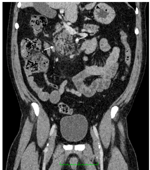
Image 2. Coronal computed tomography view showing inflammatory stranding of the pancreatic head (arrows).