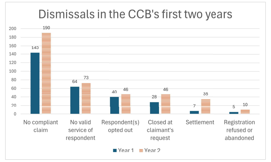
Figure. 2 – Dismissals in the CCB's First Two Years

What's happening with all these closed cases? Most of them were dismissed because the claimant failed to file a compliant claim, which means they did not comply with some of the procedural or substantive requirements laid out in CCB regulations or in the CASE Act itself. When this happens, the CCB issues an order to amend, a helpful document explaining to the claimant what the problems are with their claim and how to fix them.