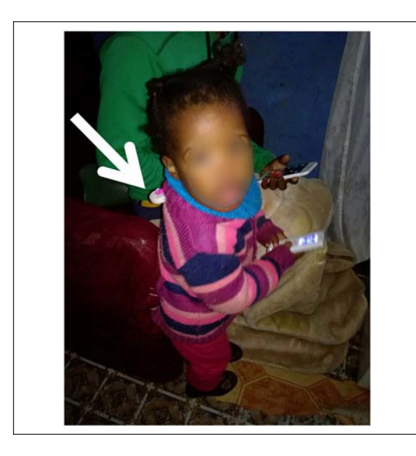
Figure 2. A child wearing a proximity beacon to estimate time spent with caregiver.

rapid advances in the field over the past 5 years. The rate at which DNNs continue to improve at tasks such as visual recognition are accelerated over this time, although there is concern that these current methods will soon begin to plateau.