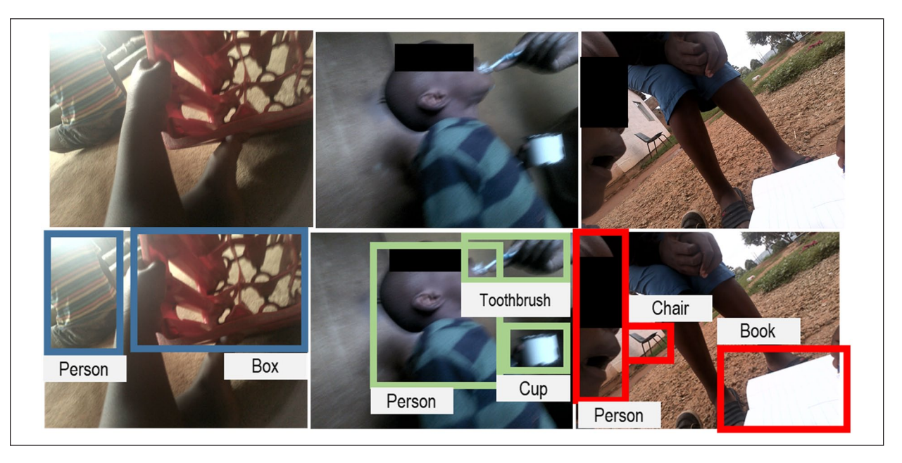
Figure 3. Wearable camera captures from top left (a child at play, dental hygiene and a homework session outside) and what an automated object detection algorithm identified.

run ahead of appropriate legislation.53 The Emanuel framework for ethical biomedical research states that to be ethical, research must (1) be a collaborative partnership, (2) have social value, (3) be scientifically valid, (4) allow for the fair selection of participants, (5) have a favorable risk-benefit ratio, (6) undergo independent ethical review, (7) require informed consent, and (8) maintain ongoing respect for participants.54 Classic guidelines such as these are now beginning to be updated to include further protection for participants in the era of biomedical big data analytics, where insights can be generated from social media feeds, personal health monitoring platforms, home sensors, smart phones, and online forums and search queries.<sup>55</sup> One example is the Ethics Framework for Big Data in Health and Research that lays out a set of clear processes for recognizing and resolving issues arising from research with these types of data.56 Significantly, this framework raises the challenges associated with informed consent as the foundational ethical pillar for these types of data and explores alternative ethically acceptable alternatives such as the principles of respect for persons and social license.