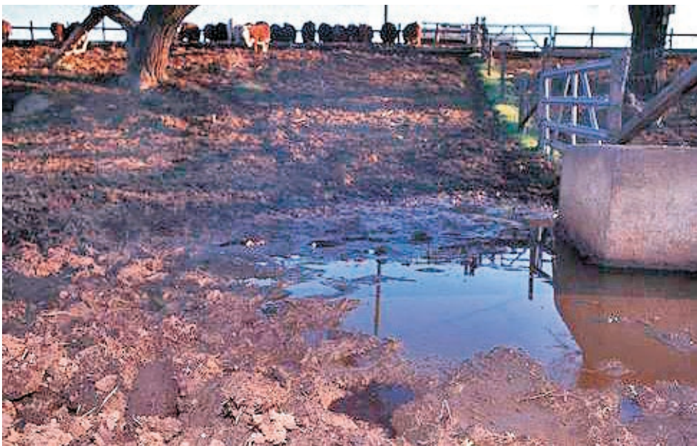
Figure 6. Mosquitoes can breed in poorly drained dairies.

Draining fields at the end of the growing season does not usually generate a mosquito problem because remaining predators tend to concentrate in residual water. Nevertheless, well-graded and even-draining fields, borrow pits, and ditches help reduce mosquito numbers because some areas may lack predators. Rice fields can also produce mosquitoes in the fall if they are reflooded for straw decomposition and to create wildlife habitat. Fields should be reflooded as late as possible because mosquito reproduction decreases in cold weather.