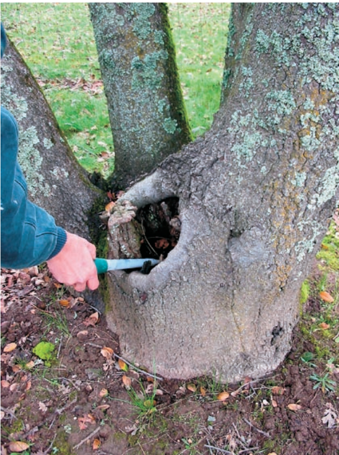
Figure 3. Treeholes like this one may provide habitat for mosquitoes.

Ponds and natural pools that livestock drink from may become serious mosquito-breeding areas. Animal waste adds nutrients to the water that benefit mosquitoes, and hoofprints create puddles where mosquitoes may be isolated from predators. If feasible, fence ponds along the edge to create a single access area. This keeps the animals from trampling the entire edge, although if too much room is left between the pond and fence, animals may still create ruts. Paving the access point can reduce puddles, but be sure to provide good footing for the animals. Weed control reduces hiding places for mosquitoes. It may be necessary to treat these ponds regularly with a biological larvicide or to introduce insect-eating fish if they are not already present. However, do not introduce fish unless the pond is man-made and isolated from natural waters.