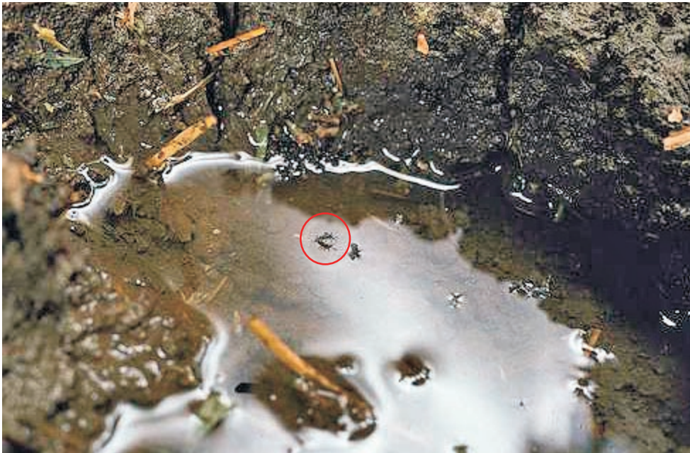
Figure 4. A mosquito (circled) emerges from a water-filled hoofprint caused by putting livestock on a wet pasture.