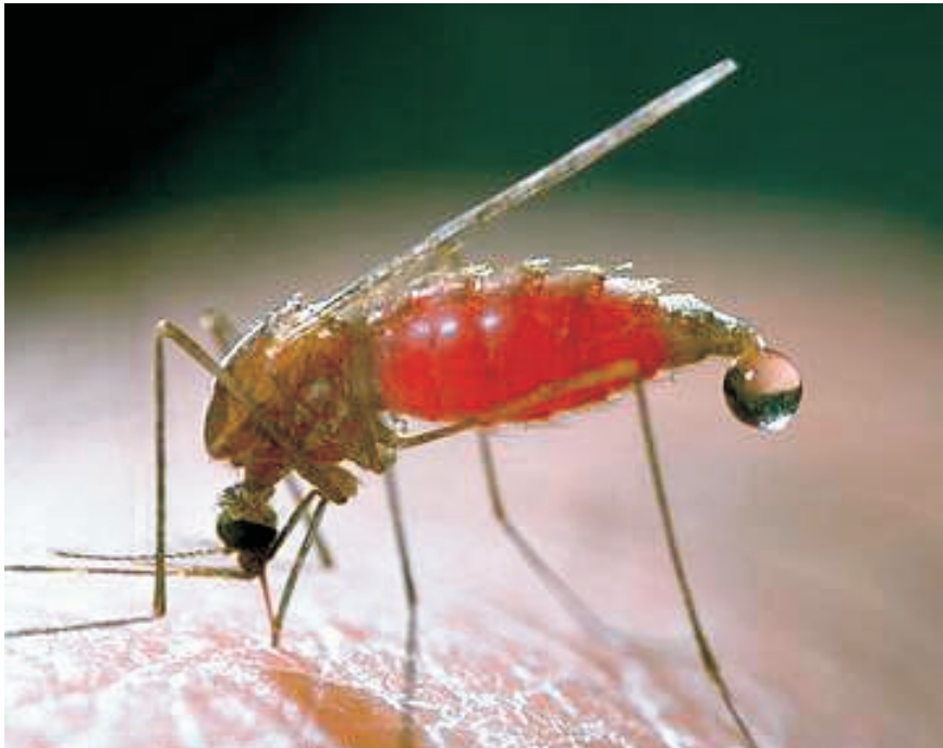
Figure 9. Anopheles freeborni .

but may bite during the day in deep shade. Females obtain blood meals from birds or mammals and can transmit diseases between these groups. They are active in spring through fall. They survive through the winter as adults in barns, culverts, caves, and similar dark, protected places.