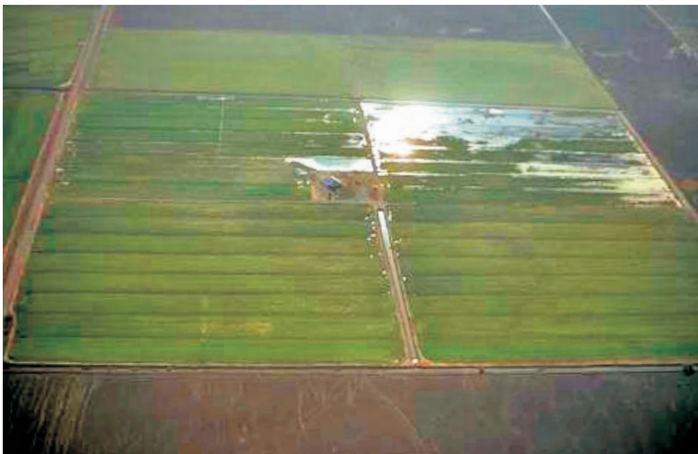
Figure 5. Standing water in irrigated rice presents a great challenge for mosquito control.

Weedy fields and levee edges can provide shelter for mosquito larvae. Predators hunt less efficiently in dense weeds, so good weed control practices help control mosquitoes. However, many her-