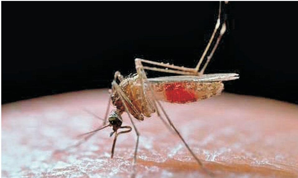
Figure 8. Culex tarsalis .

in your area, it is helpful to make sure that mosquito control and drainage have been considered and that the local MVCD is aware of the project.