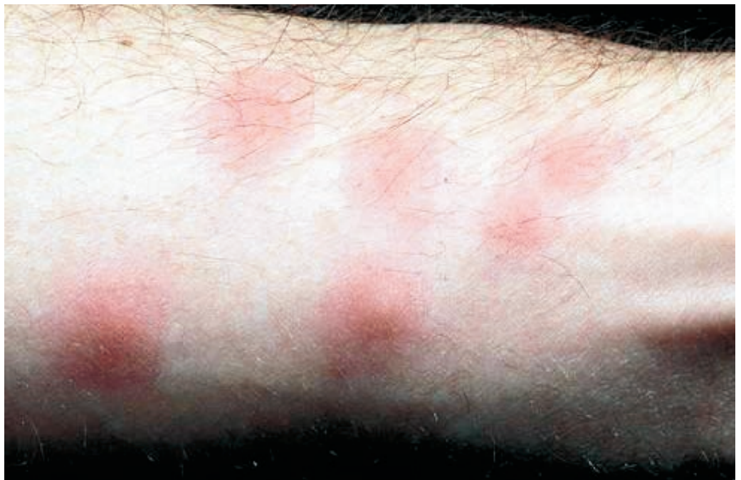
Figure 1. A bumper crop.

Third, mosquito problems can decrease property values and cause labor problems. Areas infested with mosquitoes are less desirable places to live and work. Farmworkers may refuse to work if a serious mosquito problem exists. Homeowners