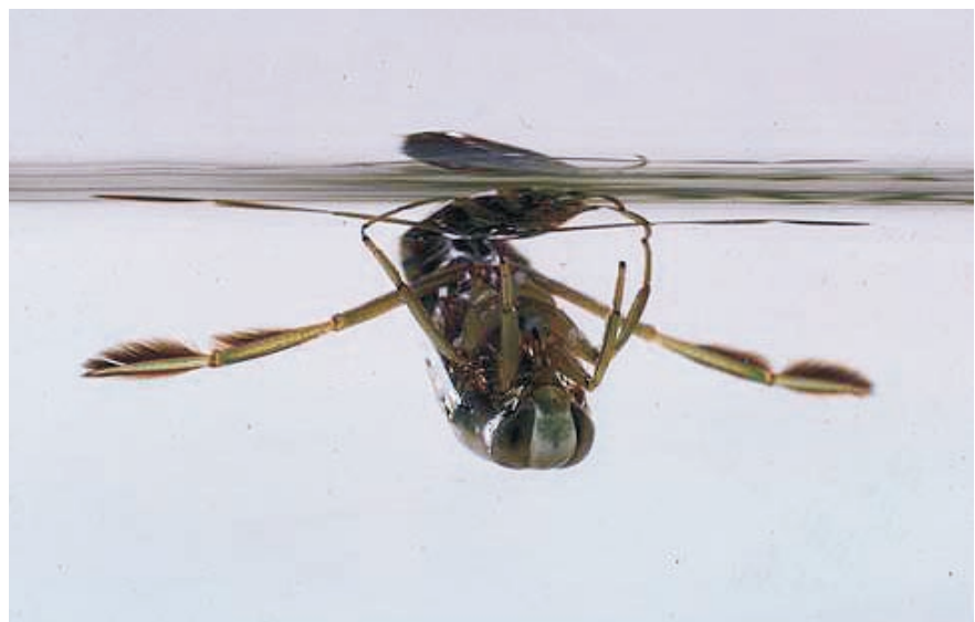
Figure 7. Dragonflies (left) and backswimmers (above) can provide natural mosquito control.