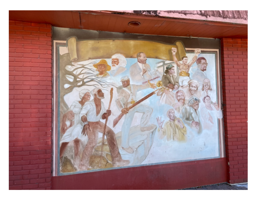
Figure 5. Zora Neale Hurston honored among powerful Black figures. Downtown Eatonville.

I realized how close you are to me only after visiting the Rollins Archives. Your legacy directly touched me when I learned about your work with the school to get students engaged with Black folklore through theater. The archival record at the school values your commitment to supporting the liberal arts, too. In our class, we pondered why we had not heard about the theatrical performances you directed here in the 1930s. We were inspired to ask the theater department if they would ever bring back your plays again, to continue to spread your work to a greater audience. I hope you think fondly of the memories and relationships you made at Rollins. Beyond Rollins, I'm encouraged by the efforts of young anthropologists to preserve your legacy as a founding figure of American anthropology, and I hope to do the same by sharing your life and stories with my peers.