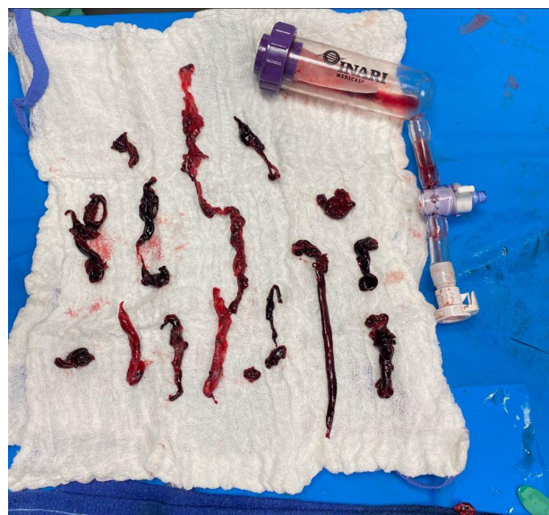
Image 3. Demonstration of clot burden following thromboaspiration by Interventional radiology service using clot retriever device.

Phlegmasia cerulea dolens is an uncommon, life-threatening manifestation of DVT, resulting from critical thrombosis of the deep and superficial venous systems leading to arterial compromise and decreased perfusion. Risk factors for PCD are similar to other DVT and include malignancy, hereditary coagulopathies, surgery, trauma, IVC filter placement, pregnancy, smoking, and use of hormonal contraception. 4,5 Unlike simple DVT, PCD also carries risk of compartment syndrome, rhabdomyolysis, electrolyte disturbances, tissue ischemia, gangrene and limb loss, fluid sequestration leading to hemodynamic compromise, and consequent multiorgan failure. 3