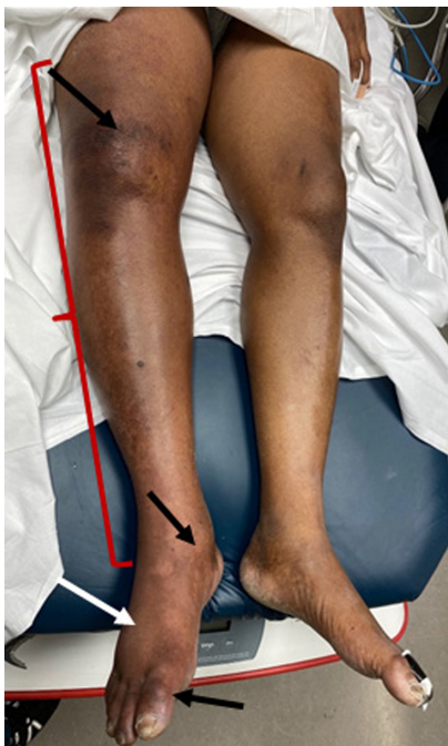
Image 1. Patient's right leg with evidence of enlargement (red bracket), darkening of skin around joints (black arrows), subtle reddening and purpling of tissues (white arrow).

Popliteal, posterior tibial, and dorsalis pedis pulses were palpable. He endorsed pain on passive motion, paresthesias, and decreased sensation distal to the knee. He was able to flex and extend at the hip joint but had complete paralysis below the knee. His left lower extremity was warm and well-perfused, with no edema or neurologic abnormalities. The remainder of his physical exam was unrevealing. Laboratory analyses were notable for normocytic anemia with hemoglobin of 7.7 grams per deciliter (g/dL) (reference range 13.2–16.6 g/dL), consistent with his prior admission,