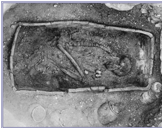
Figure 1. Pottery coffin (c. Naqada IIIA1). El-Mahasna, grave H92.

subterranean tombs is attested at a few sites in late Naqada II (e.g., Tomb 100 in Hierakonpolis), but by early Naqada III, this had been adopted as a standard feature of high-status burials, such as at Minshat Abu Omar (Kroeper 1992: fig. 3). The series of Naqada III brick-lined tombs at Abydos, some with multiple chambers, form direct precursors to the 1 st and 2 nd Dynasty royal tombs that extend south from this location.