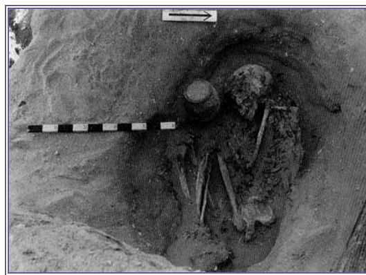
Figure 4. Maadi, burial number 44 (c. 3900 – 3600 BCE).

recorded from the cemetery is attested in the settlement, only certain forms from the settlement were deemed to be appropriate in a funeral context (Buche 1998: 86). Comparison of the types of flints found in settlement and burial contexts also reveals preferential selection for blades, bladelets, and knives for use in mortuary arenas (Holmes 1989: 333). Palettes may also have been used differently in funeral contexts in comparison to everyday life, with green malachite staining predominant in burial contexts but red ochre more common on settlement palettes (Baduel 2008).