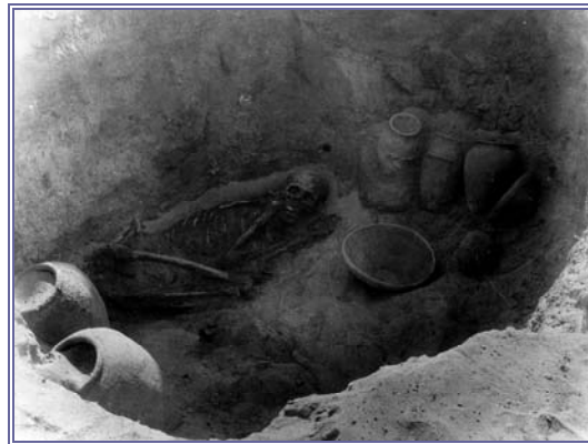
Figure 3. Naqada II burial (c. Naqada IID). El-Abadiya (Diospolis Parva), grave B379.

Such choice in funeral arrangements is also clear from the objects selected for inclusion in the tomb. It was previously assumed that some objects were made specifically for mortuary consumption, such as decorated pottery (D-ware). Examination of use-wear and settlement deposits has demonstrated, however, that this is not the case (Buche 1998) and that the majority of tomb paraphernalia derived from daily life. Nevertheless, with the benefit of concurrent excavation of cemeteries and settlement at Adaima, it is evident that whilst all the pottery