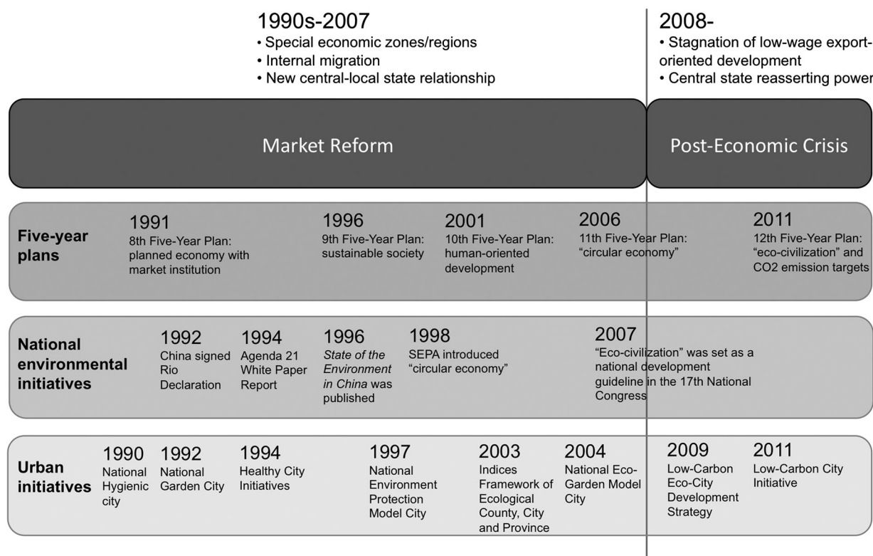
Fig. 1. Chinese eco-state restructuring since the 1990s

Environment Protection Bureau, the highest environment protection authority in the 1980s, was elevated in 1998 to a ministry-level apparatus, becoming the State Environmental Protection Agency. In 2004, the promotion and implementation of a circular economy was taken over by the National Development and Reform Commission, the State Council committee in charge of national economic and social development plans. In 2008, the State Environmental Protection Agency was further elevated, becoming the Ministry of Environmental Protection with the same administrative power as the ministries of Housing and Urban–Rural Development and of Commerce (the principal state agencies controlling economic development).