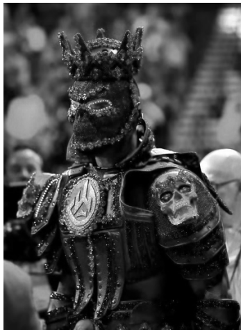
FIGURE B. Deontay Wilder in his warrior couture outfit designed by Donato Crowley and Cosmo Lombino worn on the night of his February 22, 2020 against Tyson Fury.

By commissioning his suit with Cosmo and Donato, Wilder was able to walk to the ring in an outfit that reflected his Blackness and honored iconic and historical Black figures that came before him. The suit also echoed a visual representation of a superhero, with the purpose of being seen and to captivate audiences. This is important because it demonstrates Wilder’s use of his body and utilization of visibility to make claims to sporting entitlements and the humanity of Black people everywhere. It is an example of employing a “body politics of dignity,” which Luis Alvarez defines as the use of Black and Brown bodies to resist and confront the denial of their dignity due to their bodies being discursively constructed as dangerous and criminal. 177 This deployment of body politics of dignity takes place within the context of police brutality in the U.S. where Black Americans, who account for less than 13 percent of the U.S. population, are killed at more than twice the rate for White Americans. 178