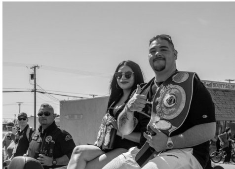
FIGURE A. Andy “The Destroyer” Ruiz Jr. at his victory parade in the city of Imperial in June 2019.

resistance to racism and fatphobia 437 and speaks to the ways in which fighters are assigned categories of values and function as commodities to the boxing industry. In this case, Ruiz was a “Fan Friendly” fighter with a well-known name that was perceived as not being too big of a risk for Joshua, who entered the fight as a “Cash Cow.” In winning this fight, Ruiz not only captured three world titles, but also disrupted the plans of the promoters and boxing industry as well as popular notions of what an athlete is supposed to look like. This story contains the elements of fashion, music, and expressive culture, which are utilized by Ruiz to express himself and, whether intended or not, make claims to resistance and sporting entitlements. It is a Chicana/o and Central American Studies and Ethnic Studies project. Not to mention it gave people of the Imperial Valley, a border town located in southeastern California, something to be proud of during the assaultive era of the Trump presidency.