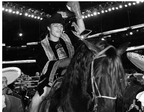
FIGURE C. Jorge Arce's ring entrance on January 27, 2007, riding a horse.

sentiments of Arce's ring entrance that happened six years earlier, what is clear is that he entered the ring in a way that countered American sensibilities. With the help of a dancing horse, Arce entered the ring exuding Mexican pride, dignity, and joy that was contagious to all his fans on that January night in Anaheim, California.