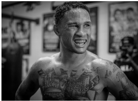
FIGURE E. Regis “Rougarou” Prograis with a tattoo that represents his home city of New Orleans.

the Rougarou would hunt children down if they broke their Lenten promise. 353 Prograis first wore the mask in his 10 th professional fight in 2014 and it represents a southern Louisiana and Cajun history. Four years later, Prograis had a ring entrance that utilized a massive entourage that allowed him to creatively center and perform a New Orleans Mardi Gras Indian subjectivity.