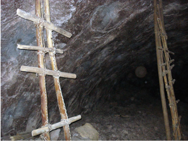
Fig. 6.4 Ladders used to reach higher areas in the mine