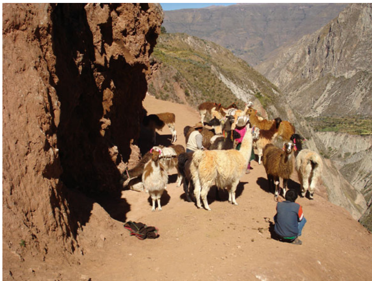
Fig. 6.6 Llama caravan bearing rock salt near the mine's entrance