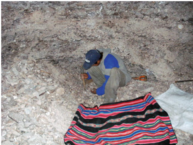
Fig. 6.3 Extracting rock salt in the mine

The cooperative would choose a head of operations for the mine and this individual held the key to the mine's entrance. Other fixed term positions were determined by the cooperative with expectations that each member would fulfill a variety of roles during their lifetimes. Cooperative members and their family members had rights to a particular part of the mine and each group worked the mine with very little hierarchical control. One of the few concessions made to the state was the hiring of an engineer to annually inspect the mine and mark the pillars of rock salt used to maintain the mine's integrity with large red "X"s and skulls and cross bones.