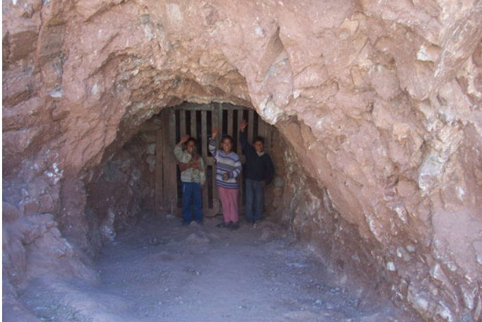
Fig. 6.2 Children in front of the gate of the Huarhua mine

caravans, the salt is exchanged in the southern Peruvian Departments of Arequipa, Cuzco, Apurímac, and Ayacucho (Flores Ochoa and MacQuarrie 1994: 125–127).