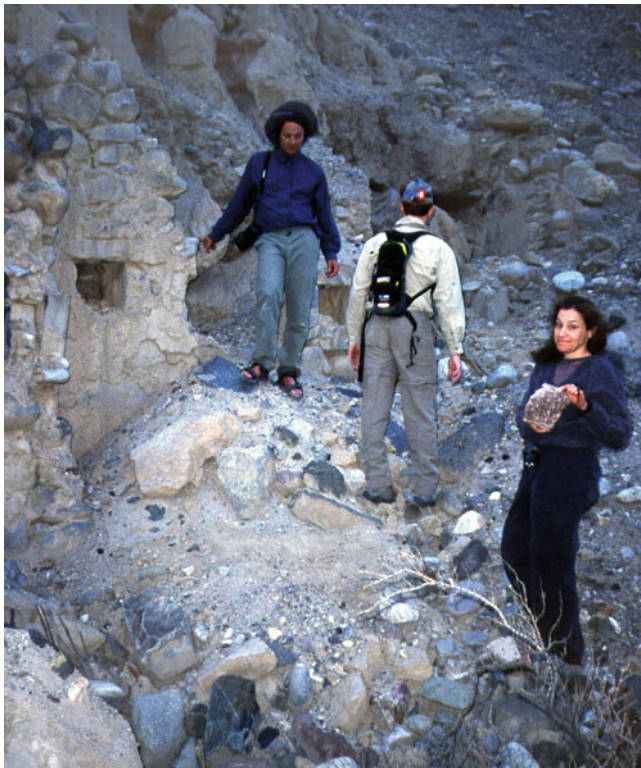
Fig. 6.7 The woman in the foreground holds a piece of rock salt found outside of a looted tomb at Toccec

The only rock salt source for which extensive early Spanish documentation exists is the Cerro de Sal in the Tarma area of southern Peru (Tibesar 1950; Verese 2002, 2006). In the seventeenth and eighteenth centuries, several groups from the Amazon and eastern Andes visited the site on annual trips that occurred usually in the months of July, August, and September. The salt was quarried from an exposed 18-m wide vein near Cerro de Sal's summit that ran for 16.5 km (Tibesar 1950: 103–104). As many as 500 people would work the vein using iron axes and river cobbles to carve out blocks of salt that weighed between 15 and 22 kg (Tibesar 1950: 103–106). While some of the salt was transported away in baskets, most of the salt was carried down to the Paucartambo River where it was loaded on to balsa rafts for passage into the jungle. Most of the rafts were made on the spot, packed from bow to stern with salt, and then loosely tied together into flotillas of 10–20 vessels (Tibesar 1950: 106).