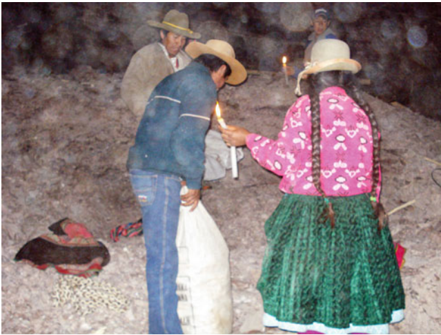
Fig. 6.5 Locals organizing bags of salt by candlelight

provide illumination for workers (Fig. 6.5). Most of the quarried salt is shoveled into bags that can hold about 11.5 kg of salt, and then loaded into wheelbarrows or on to one's shoulder. Particularly large chunks of salt are sometimes left intact to sell as saltlicks for animals.