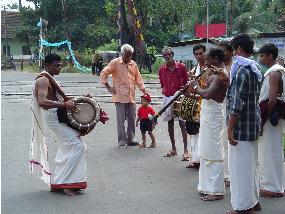
Figure 2.2 Periya Melam ensemble leading a procession during the Ernakulathappan festival, Ernakulam, Kerala.

The chinna melam was an ensemble whose functions were associated primarily with dance performances. This community of artists consisted of dancers, known also as devadasis , and their instructors, known as nattuvars , whom provided the rhythmic accompaniment. 8 Initial accounts regarding the instrumentation of the chinna melam include the sarangi , a bowed fiddle; mridangam or tabla , drums specific to South and North India respectively; sruti-upanga , drone; and tala or jalra , cymbals. 9 Additionally, several other percussion instruments came to be included within the ensemble such as the kanjira , a