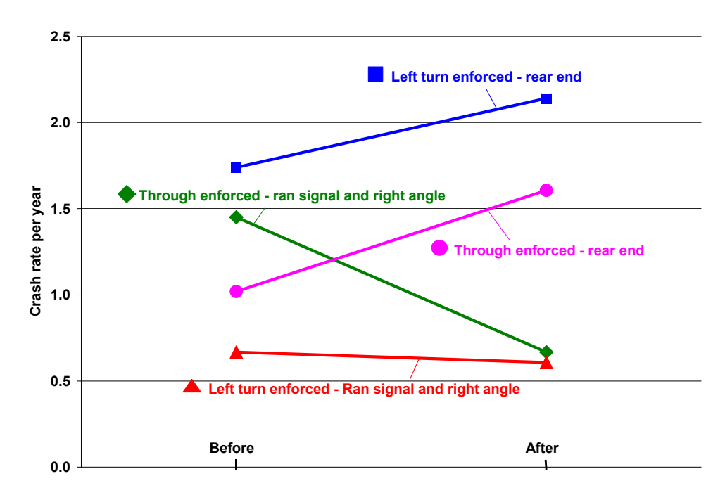
Figure 3. Average Crash Rates Before and After Enforcement for Intersections by Type of Movement Enforced and Type of Crash

For the nine LTH intersections, average RA/RS crash rates dropped from 0.67 to 0.61 crashes per year, while rear end crashes increased from 1.74 to 2.14 crashes per year. Neither of these changes in crash rates for LTM intersections was significant at the p = .05 level (p = .427 for RA/RS crashes and p = .131 for RE crashes). It can be concluded that photo enforcement was more effective in reducing the rate of crashes at intersections where the through traffic movements was enforced. This finding would appear to be of importance when considering criteria for the selection of locations for photo red light enforcement cameras.