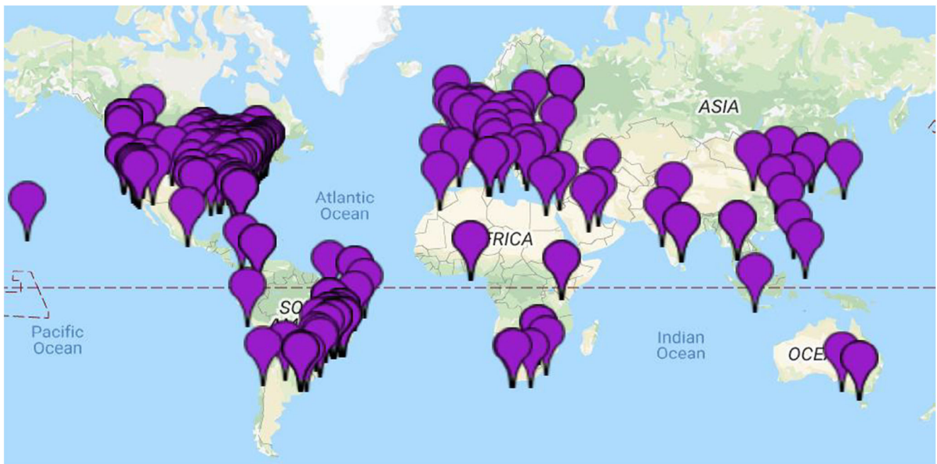
Fig. 1 Purple pins represent locations of the Oncofertility Professional Engagement Network (OPEN) member centers. OPEN consists of individuals or groups from 45 countries and is linked by basic and

clinical research a high-level of shared protocols and experiences. Member leverage work done in affiliated centers to accelerate their formation and services offered [1–7]