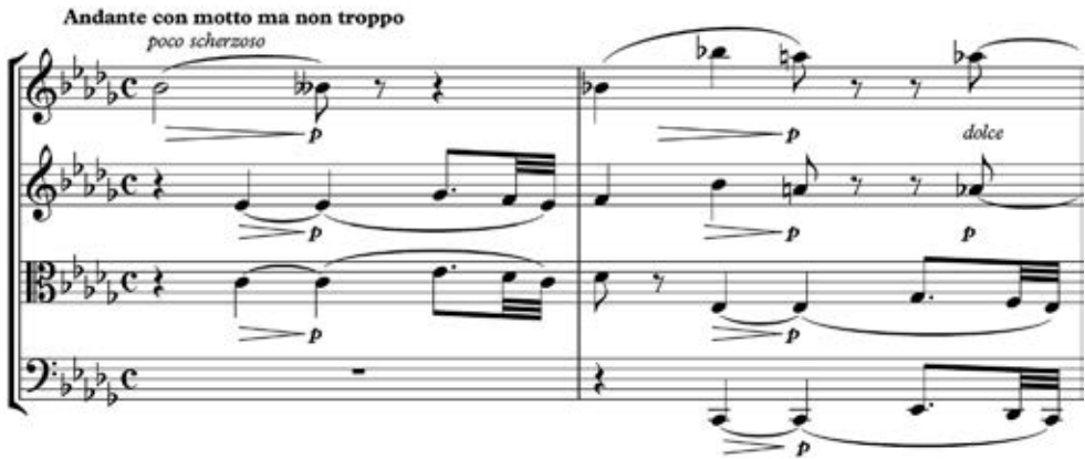
Example 3a: Beethoven, String Quartet No. 13, Op. 130, Andante con motto ma non troppo, bars 1–2