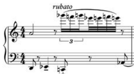
Example 8: Rihm, Klavierstück Nr. 6 , bar 82

Killmayer's analysis highlights the paradoxical nature of Rihm's engagement with Brahms: "This setting and formulation, which is not thought of as historic or literary, represents no quotation in the strict sense", he argues. "It should have been invented here, had it not already been there". 70 It is out of time, therefore. "Retrieved from memory", he suggests, "it then adapts to a shape, as it has refined in carrying around the theme over time. The theme is discovered here, not quoted". 71