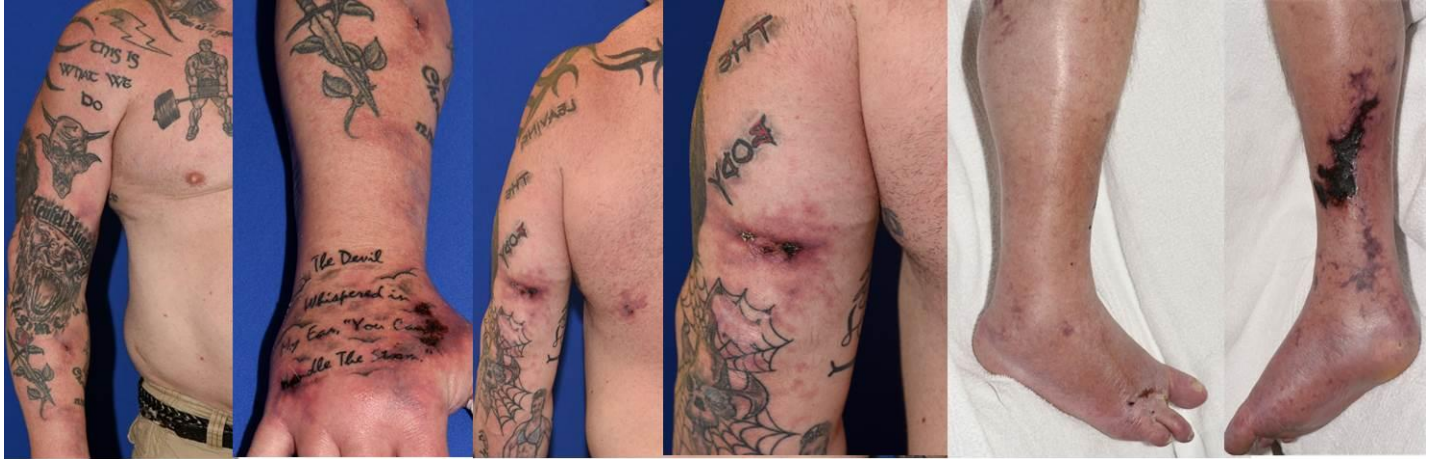
Figure 1. Multiple, reddish-purple to dusky violaceous, stellate patches with variable central ulcerations on the right upper extremity, left upper extremity, left back, and lower extremities.

triggering increased vascular endothelial growth factor (VEGF) production from endothelial and dermal fibroblasts [1]. Accordingly, DDA has been described in association with smoking, peripheral vascular disease, and hypercoagulable states leading to impaired vascular perfusion such as is seen in antiphospholipid syndrome, monoclonal gammopathy, or calciphylaxis [1].