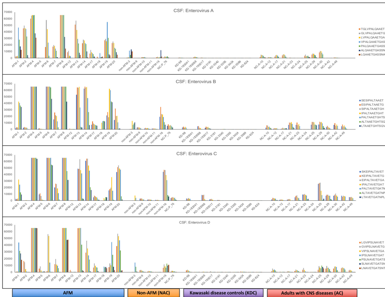
FIG 2 Immunoreactivity against VP1 conserved peptide sequences of EV-A, EV-B, EV-C, and EV-D in cerebrospinal fluid samples of patients with AFM, non-AFM controls (NAC), Kawasaki disease controls (KDC), and adults with CNS diseases (AC). All AFM and NAC specimens were from 2018, except NC-P_76.

Across the entire EV capsid proteome tiled with 160,000 peptides, the conserved EV VP1 peptides were consistently immunoreactive in CSF of 79% (11/14) of children with AFM, the majority of whom had no EV RNA in CSF. In comparison, NAC patients without evidence of EV RNA in any specimen and KDC patients did not have antibodies to EV peptides in CSF. This conserved peptide region reflects broad EV immunoreactivity, suggesting an association with EV infection and AFM. It is also consistent with EV pathogenesis in mouse models, wherein EVs, including EV-D68, can cause paralytic illness (11, 12).