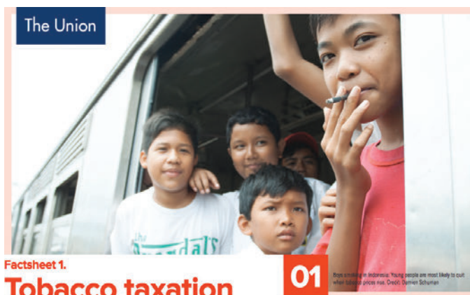
FIG 3. Cover of the International Union against Tuberculosis and Lung Disease's Factsheet on Tobacco Taxation, with the caption "Young people are most likely to quit when prices rise."

that the shift from mass public information campaigns to sin taxes that marked the field of international tobacco control in the late 1990s was not a shift from the social to the individual, but rather a change in the concept of the individual. It was a move away from an individual for whom knowledge always and automatically triggered certain actions to an individual who could decide not to act on knowledge and prioritize other elements such as money and pleasure instead. Last, the strong emphasis placed on individual choice in both Becker's attempts to reform economic thought and global health efforts to curb smoking should not be interpreted as the death of the social. Indeed, in echo of Collier's (2011) work on the post-Soviet social, the notion of the social or society has remained important for both projects, albeit in different forms. Thus, for Becker (1997:150), sin taxes are "social taxes" that can protect American "society" from the "social harms" associated with rational addictive behaviors, whereas for global health experts, sin taxes are public health "interventions" that can shield developing "societies" from the health effects and "socio-economic toll" of "21st-century lifestyles" (WHO 2010:vii, 37). ■