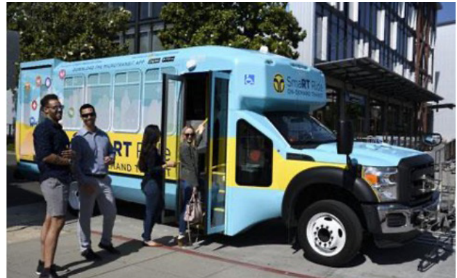
Figure 1. Sacramento Regional Transit SmART Ride vehicle (Sacramento Regional Transit, n.d.)

Low-Density Service: Microtransit has the potential to provide demand-responsive services in low-density built environments where low ridership may result in inefficient