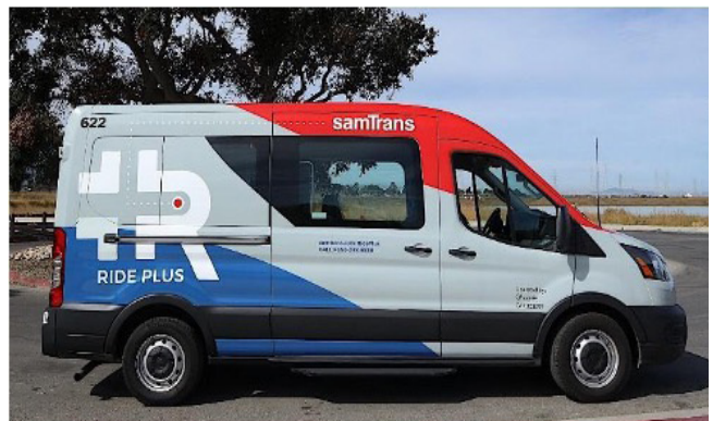
Figure 3. SamTrans Ride Plus vehicle (SamTrans, n.d.)

Labor Relations: Microtransit services can be operated by public transit employees, e.g., BeeLine in Yolo County, CA, or contract labor provided by a service provider, e.g., Calexico On-Demand in Calexico, CA.