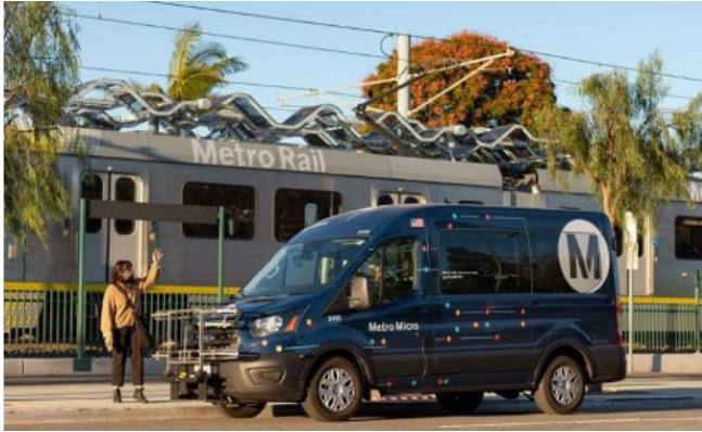
Figure 2. LA Metro Metro Micro vehicle (LA Metro, n.d.)

to drivers that work for both paratransit and microtransit services. Commingled trips refer to a single service that provides rides for paratransit and non-paratransit customers (i.e., shared rides). For example, High Valley Transit Micro in Summit County, UT, allows drivers to drive both paratransit and general public passengers within the same shift, using the same vehicle, but not at the same time (Via Transportation, 2021).