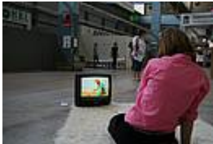
Figure 3: Ming Wong's video installation Lerne Deutsch at Kunstinvasion , Berlin, 2008. 14

decommissioned flower market in Berlin-Kreuzberg. 12 The motto of the event, which opened for two days only and presented works by about sixty, mostly German artists was—appropriately enough— Flüchtigkeit (ephemerality). 13 Unlike more cinematic video art, which was displayed on large screens in the dark basement, Learn German was installed on the building's well-lit main floor, jostling for viewers' attention with numerous sculptural pieces, photographs, sound installations, and performances. Visitors could glimpse Ming Wong's video on a small, old-fashioned box television set either while strolling through the vast, open space, or, if they were intrigued enough to watch the entire ten-minute loop, crouch down on a white shag rug that appeared to be a cheap version of the one in Fassbinder's original. The rug both extended the screened space into the hall, and subtly highlighted the class difference between original and reenactment, as well as between the performer's space and that occupied by the viewer. Across this gap, the small dimensions and placement of the monitor on the floor, moreover, brought the bodies of those willing to give Wong/Petra their attention into close alignment with hers. By thus enforcing an