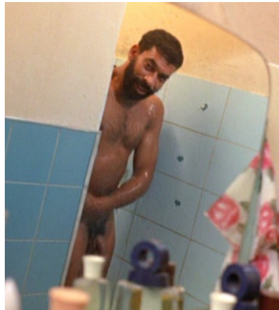
Figure 5: Still from Ming Wong, Eat Fear / Angst Essen (2008).

Fassbinder's film progressively unclothes and exposes the protagonist's body, but undermines any critique of white voyeurism and projection, first by suggesting that Ali narcissistically enjoys his own sexual exposure and, finally, by stripping for the camera, volunteering to confirm the fiction of the big black penis. In the early 1990s, Al LaValley had naively praised the unveiling of the studly Ben Salem as a sign of gay desire and empowerment (LaValley 120-21). By contrast, Wong's Eat Fear reenacts the exposure of Ali's nude body without either suggesting Ali's complicity or confirming the racist fantasy of the big black penis. Wong's choice to wear a prosthetic penis in the strip scene allows him to capture and expose the racist gaze without confirming the fiction of black hypermasculinity. The awkward and