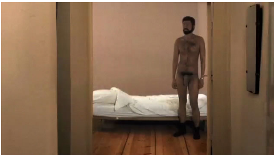
Figure 6: Ming Wong, Still from Eat Fear (2008).