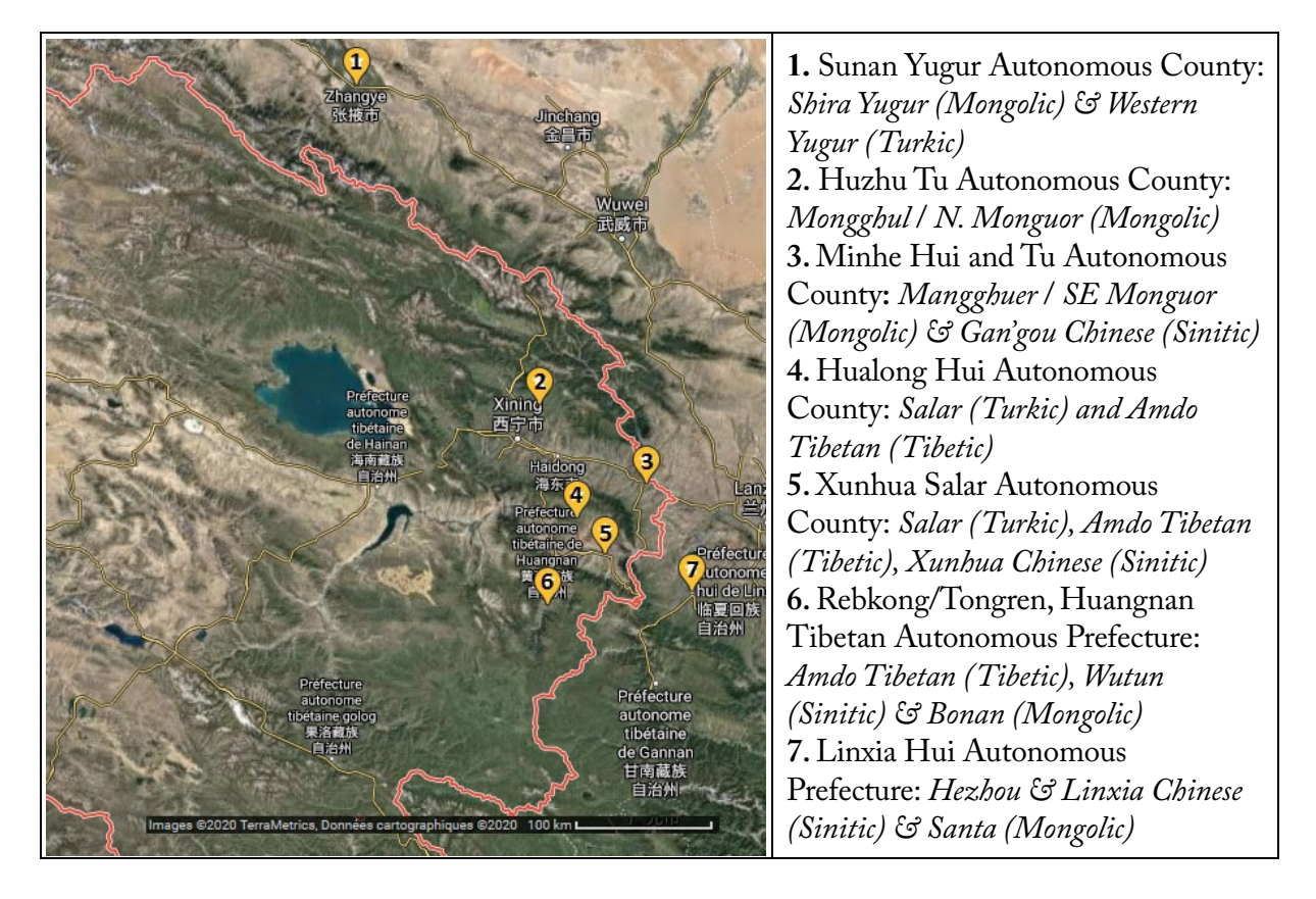
Figure 1. Location of the languages analysed in this paper

(ch. Tongren) counties, completed with a few data elicited in Paris, with a speaker from Chabcha (ch. Gonghe). Although these varieties may differ in several respect, no significant differences have been found regarding the marking of plurality.<sup>2</sup> Data for other languages are from secondary sources, listed in the references.<sup>3</sup> Following Dede (2003), three groups of Qinghai Chinese dialects are distinguished.<sup>4</sup> However, depending on the feature considered, only data for the Linxia, Xunhua and Gan'gou Chinese dialects could be accessed. Some authors only provide examples in Chinese characters (without a gloss or a transcription) when they describe these dialects: in this case, the gloss is reconstructed, based on standard Chinese, but we do not attempt to restore the phonological transcription.