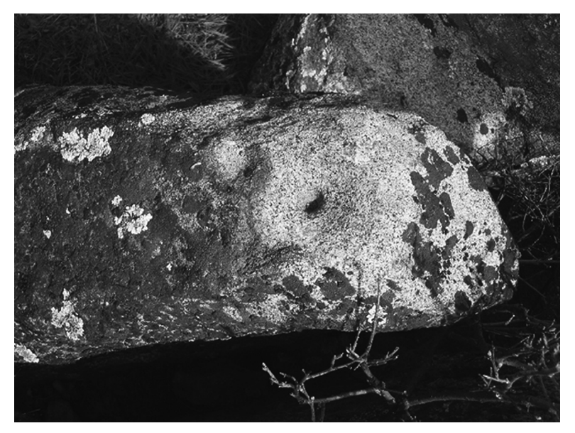
Figure 1. SDI-12923 Cupules

patterned, possibly to represent constellations or other astronomical phenomena. Archaeologists have suggested that patterned pits were made to follow the sun's apparent movement in the sky and to allow southern California Indians to identify the solstice or seasons (Brown 1999; Trupe et al. 1988). Cupules may also be associated with ringing rocks, which are unusual rocks that make a bell tone when struck (Hedges 1981:13).