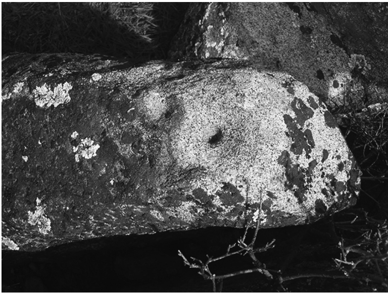
Figure 1. SDI-12923 Cupules

patterned, possibly to represent constellations or other astronomical phenomena. Archaeologists have suggested that patterned pits were made to follow the sun's apparent movement in the sky and to allow southern California Indians to identify the solstice or seasons (Brown 1999; Trupe et al. 1988). Cupules may also be associated with ringing rocks, which are unusual rocks that make a bell tone when struck (Hedges 1981:13).