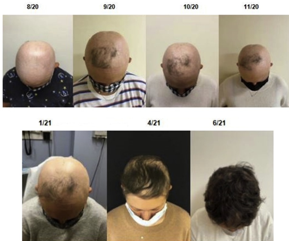
Fig 1. Photographs of frontal scalp and vertex over 10 months.

growth were 2.2 months and 6.7 months, respectively. 4 Initial hair growth for our patient did not begin until after PRP therapy was added to the systemic regimen, and significant regrowth was noted after 4 months of monthly adjunctive PRP therapy.