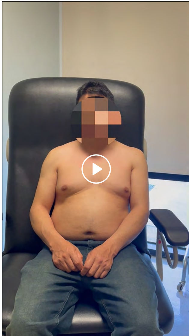
Video 2 Video demonstrates absence of abdominal tremor at 11 months since initiation of levodopa treatment. Showing patient in seated position with no observable abdominal tremor at rest or when the patient was distracted by conversation and formal motor examination.

a day. Unified Parkinson's Disease Rating Scale (UPDRS) Part III was 50.0 at initial visit and 26.0 10 weeks after the initiation of levodopa. After 11 months of levodopa treatment, neurologic examination in the ON state 4 hours after levodopa dose demonstrated sustained control of abdominal tremor and UPDRS Part III score of 7.0 (Video 2).