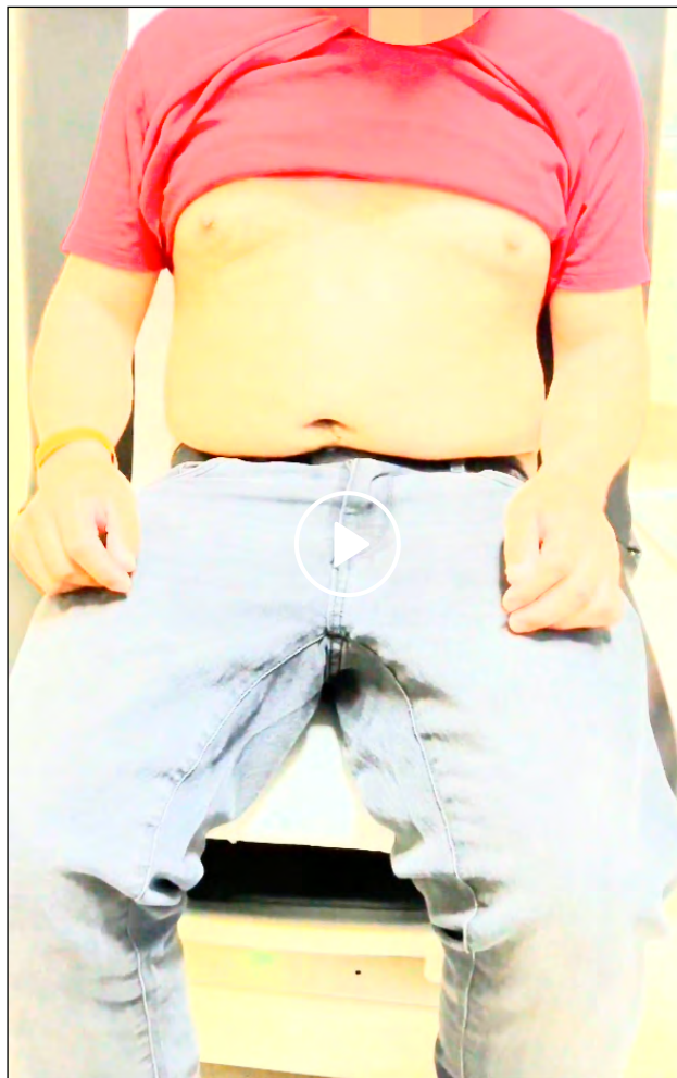
Video 1 Video shows clinical features of the patient with abdominal tremor. Showing patient in seated position with continuous, rhythmic contractions of the rectus abdominis muscles (right greater than left) that is mild to moderate in amplitude. (Written consent was obtained from the patient in this video to be submitted/published in this journal).

Additional findings included severe asymmetrical bradykinesia and rigidity in the upper and lower extremities that was more pronounced on the right, and moderate frequency, low amplitude intermittent rest and re-emergent postural tremor of the right hand, independent from the abdominal tremor. Workup for secondary causes of parkinsonism was negative. 1.5 Tesla Magnetic Resonance Imaging (MRI) of the brain without gadolinium contrast was normal. DaT (Dopamine Transporter) scan was not pursued