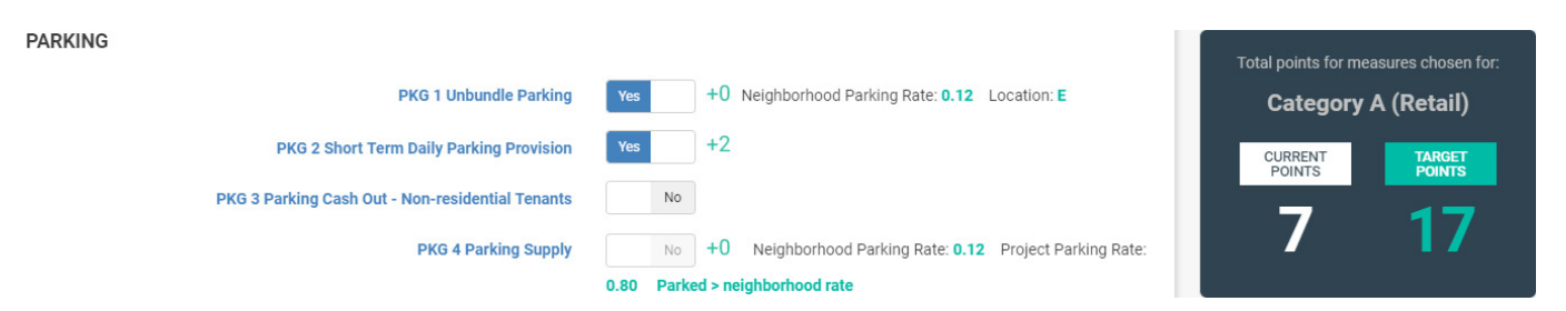
Figure 2: Sample from San Francisco Transportation Demand Management Tool