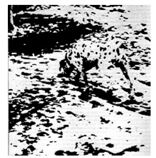
Figure 1: Spot the Dalmatian!

a picture of a Dalmatian usually fail to see any meaningful pattern in the image, whereas people who are aware that the image represents a dog not only find the dog easily but also organize the stimulus so that otherwise indistinguishable black dots become a dog, a sidewalk, and the shade beneath a tree.