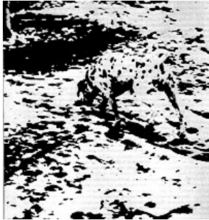
Figure 1: Spot the Dalmatian!

a picture of a Dalmatian usually fail to see any meaningful pattern in the image, whereas people who are aware that the image represents a dog not only find the dog easily but also organize the stimulus so that otherwise indistinguishable black dots become a dog, a sidewalk, and the shade beneath a tree.