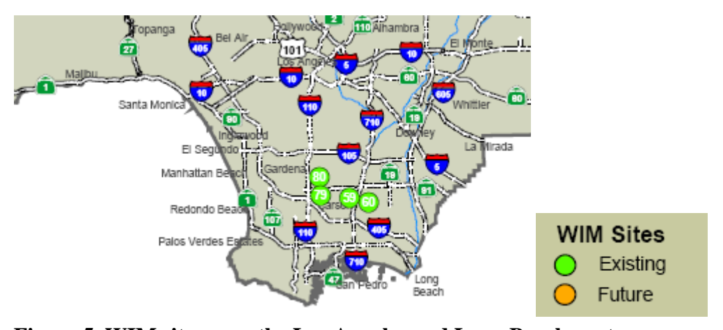
Figure 5. WIM sites near the Los Angeles and Long Beach ports.

data in that manner. The most notable change in results would be the percentage of trucks (not axles, as is currently found in the results) that are carrying loads illegally. In order for a truck to be considered overweight, one or more axles must exceed the restricted limits. Therefore, given that the percentage of overweight axles is 2.67 percent, the number of overweight trucks on the highway is somewhat lower than that. A value of around 1 or 2 percent can be reasonably expected.