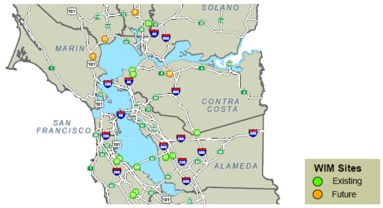
Figure 4. WIM sites in the San Francisco Bay Area.