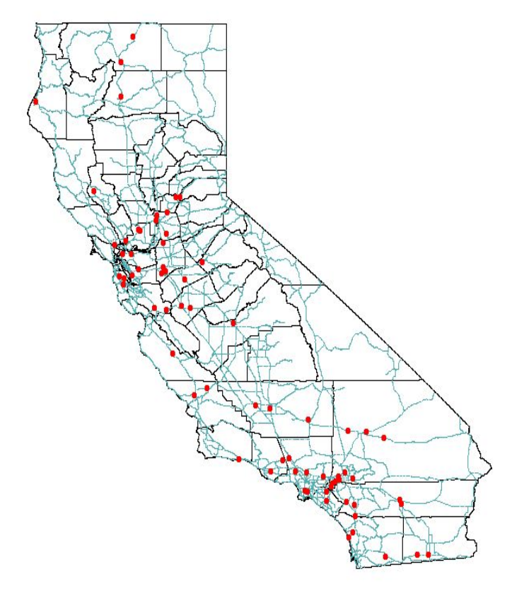
Figure 1. California WIM Sites.

Items contained in the database and used in this study include: