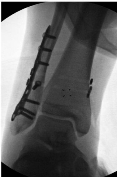
Figure 1. Intra-operative fluoroscopic image of stress test of syndesmosis following fixation of a fibula fracture. Note widening of the syndesmosis and medial clear space, with a lateral shift of the talus relative to the plafond.

the ankle joint, such as bone marrow edema of the calcaneal trochlea, cartilaginous defects, bony injuries, tibiofibular incongruence, or degenerative variations in chronic damages. However, it remains a static exam, which does not provide clear identification of syndesmotic instability. To overcome this problem, physicians need to appeal to functional tests, usually practiced under anesthesia to control the painful feeling around the ankle involved. Management of these injuries is separated into non-operative and surgical protocols based on stable and unstable image findings.