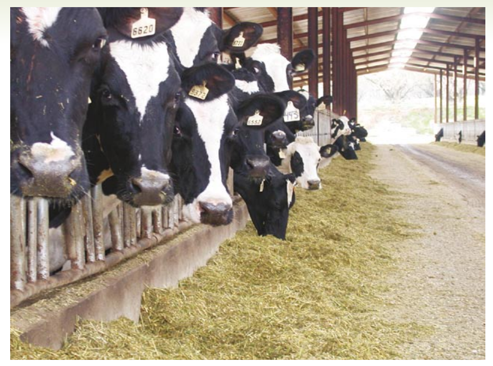
Alfalfa hay is a key ingredient in dairy cattle feed. Exposure to sun and heat can degrade the nutritional quality of hay and reduce its price.

In addition, hay stored at temperatures greater than 100°F for prolonged periods of time may form Maillard products (Pitt 1990), condensates formed from nonenzymatic reactions of sugars and amino acids. Maillard products possess many of the chemical properties of lignin, which is highly indigestible. The formation of Maillard