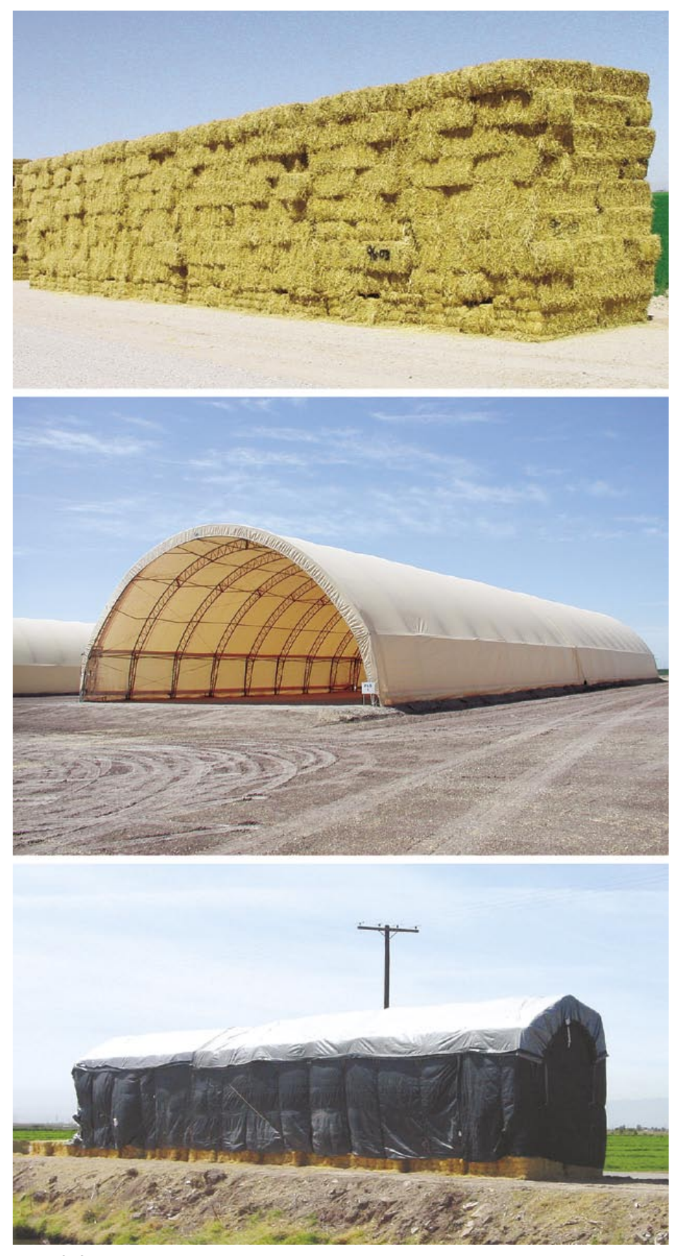
Top , alfalfa hay is normally stored unprotected along ditch banks in the Sonoran Desert; middle , hay can be stored outside but protected from rain and sunshine; bottom , tarped hay.

(nitrogen content of ADF as a fraction of total N) may be considered heatdamaged. In our experiment, ADIN/N increased significantly (P < 0.05) under all treatments, suggesting the formation of Maillard products (table 1). After 11 weeks of hay storage in the irrigated Sonoran Desert, Guerrero and Winans (1999) had ADIN/N levels of 13%, 17% and 17% for similar storage treatments. The previous baledhay storage trial was done during the summer of 1993, which was warmer than during our 1998 trial, with mean monthly maximum temperatures from June through October of 114°F, 113°F, 118°F, 112°F and 105°F, respectively.