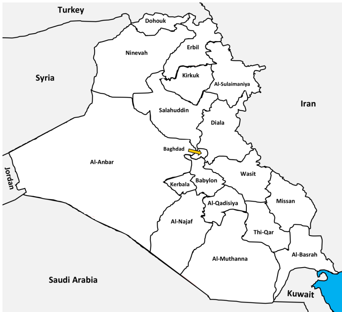
Figure 1.1. Political Map of Iraq

Note: The governorates of Dohouk, Erbil and Al-Sulaimaniya comprise the region of Iraqi Kurdistan. 7 Map Source: Al-Hemiary et al., 2017. 8