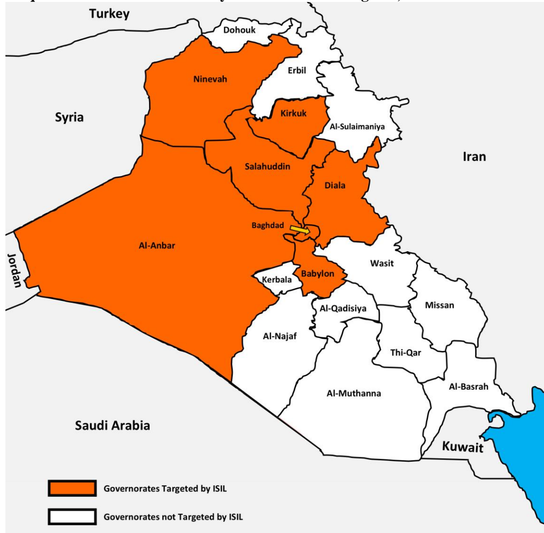
Figure 5.1. Governorates in Iraq targeted by ISIL during the study period of the Iraqi National Household Survey of Alcohol and Drug Use, 2014

Note: the governorates highlighted in this figure represent areas that were targeted by ISIL attacks from January 2014 and through the end of the study period, December 2014. 185,198