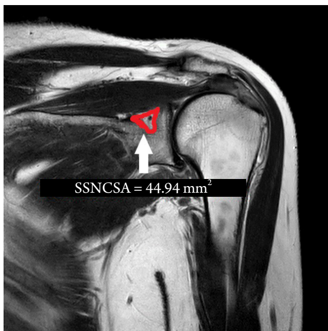
Fig. 1. Measurement of the SSNCSA (white arrow) was acquired via magnetic resonance T2 weighted images. SSNCSA: suprascapular notch cross-sectional area.

Demographic characteristics were not significantly different