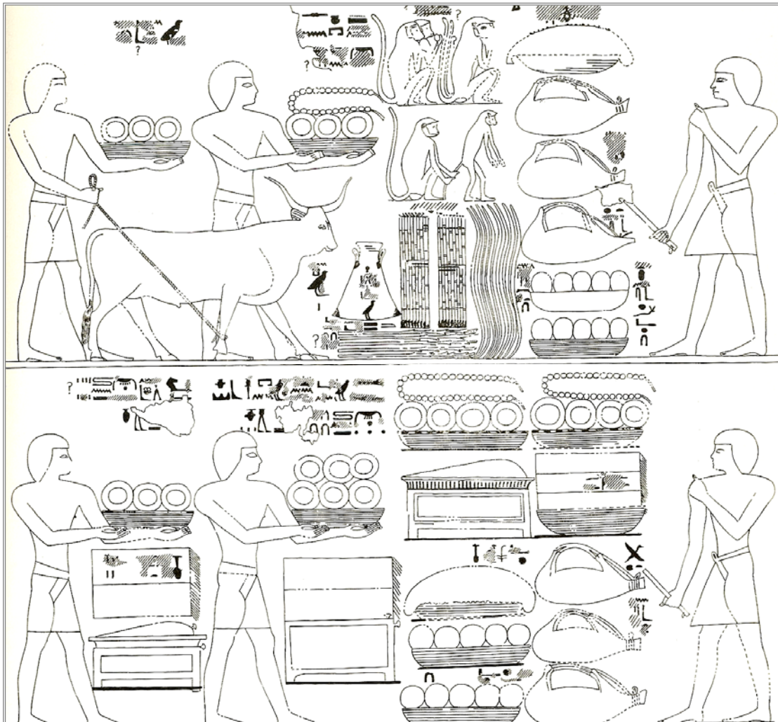
Figure 3. Collection of dues from southern Egypt (detail), Theban Tomb 100, 18 th Dynasty.

two letters (EA 39 - 40: Moran 1992: 112 - 113) from Cyprus in which the pharaoh and the vizier(?) are asked not to permit any claims being made against Cypriot merchants.