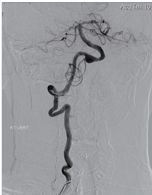
Figure 1 Angiogram of the cerebral aneurysm in Patient 2 diagnosed at 42 years. Brain MRI revealed the aneurysm shortly after the patient experienced dizziness and vomiting while exercising. He subsequently underwent Penumbra coil placement.

after treatment initiation; the pre-treatment data (over a period of up to 22.4 years) were available for a few individuals.