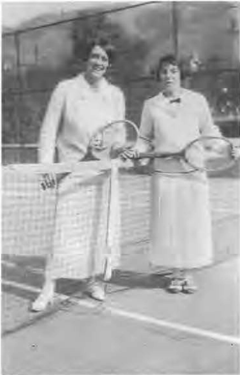
Tennis at Hearst Courts, 1920s.