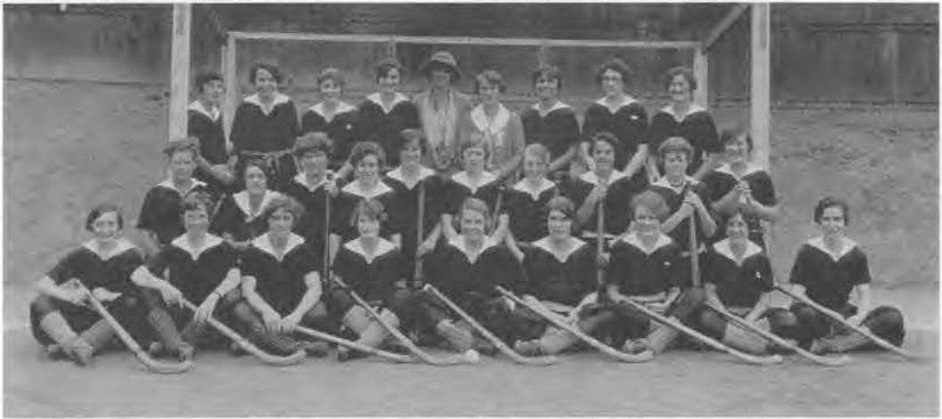
Field Hockey Teams, ca. 1926-27.