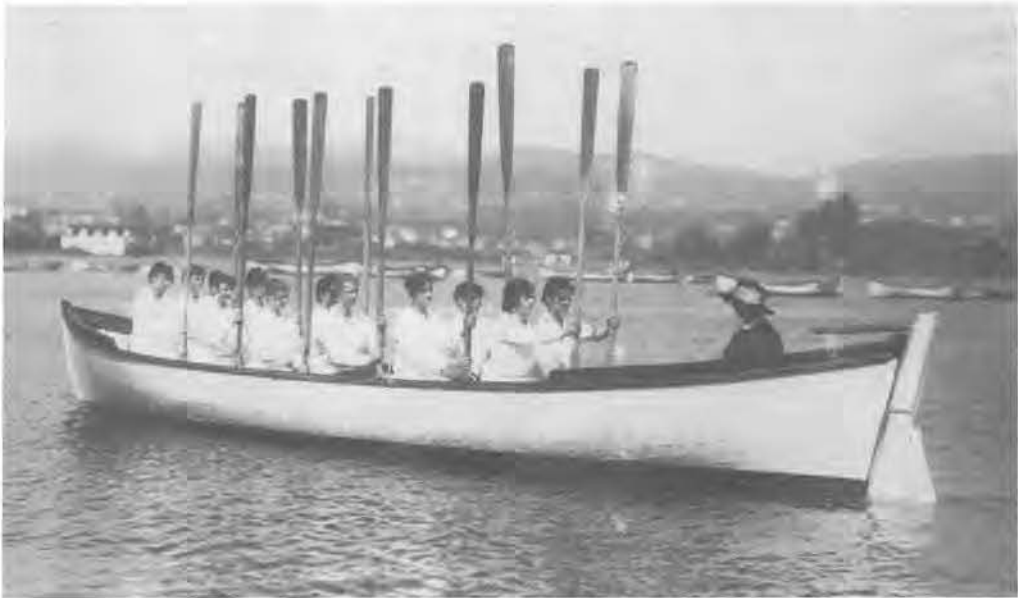
WAA Crew, Lake Merritt, 1923–1924.

This does not mean that “the fair sex” was wholly without opportunities for games-playing and other physical activities. When Vassar held its first Field Day on November 9, 1895 (track and basketball were featured) the New York World gave this novel event considerable coverage. 14 For the most part, however, women’s sports received scant attention. An article in Cosmopolitan in 1901 reflected prevailing sentiments. Although “the triumph of their class colors” might be “just as dear to them,” young women were expected to exhibit decorum in their games. Nonetheless, within their secluded precincts they often were extremely enthusiastic. 15