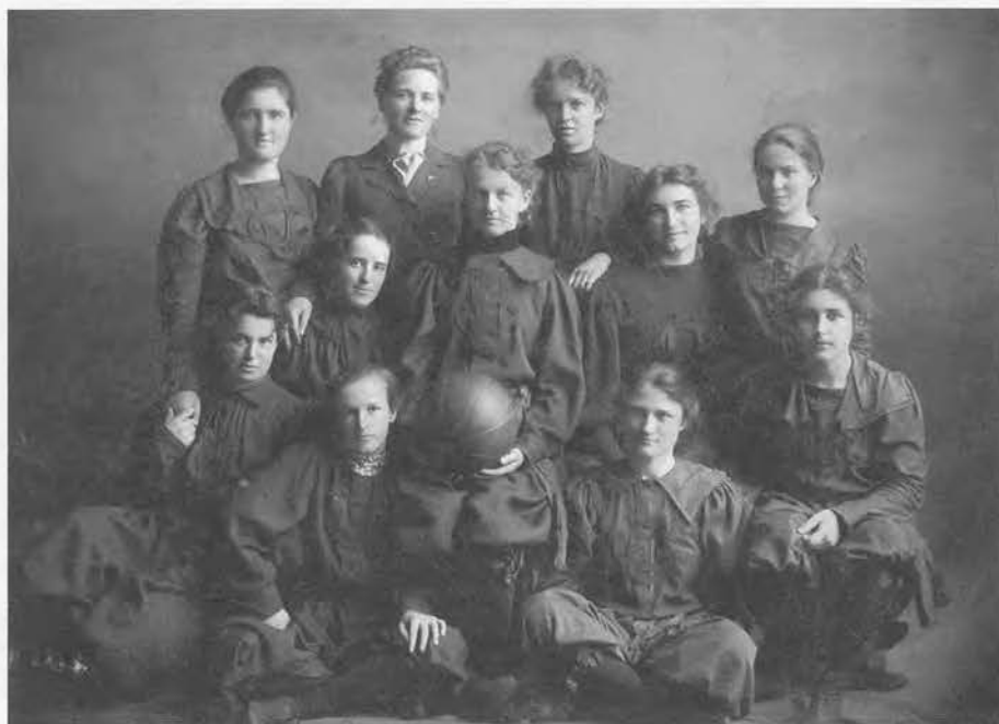
1899 Basketball team.