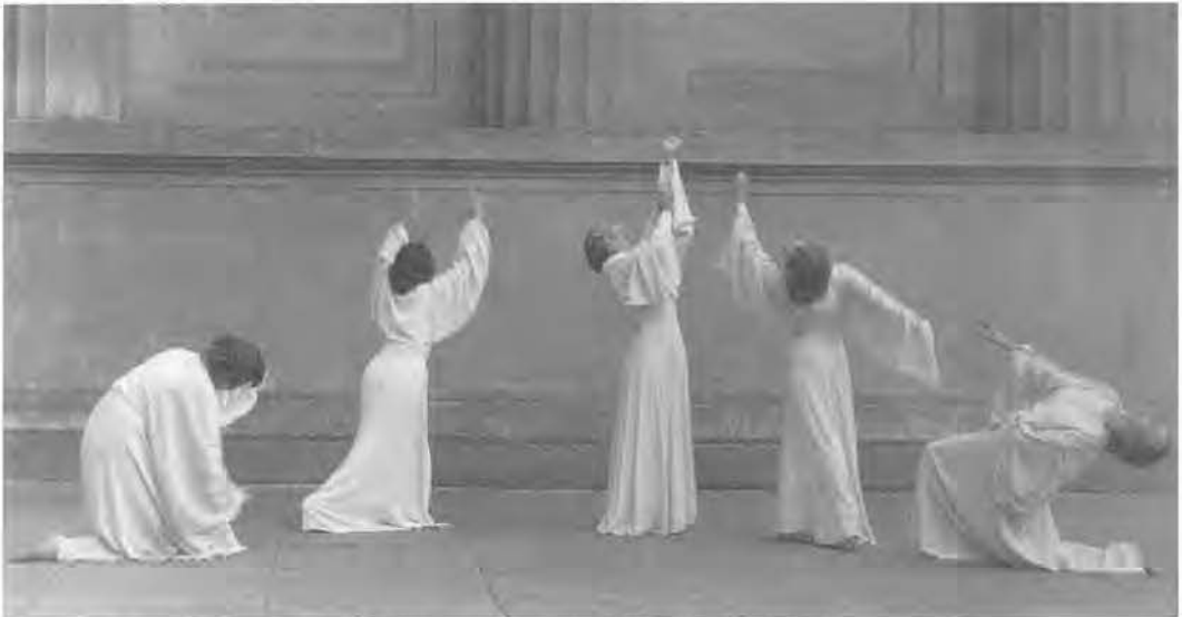
Orchesis, Greek Theatre, 1930s.