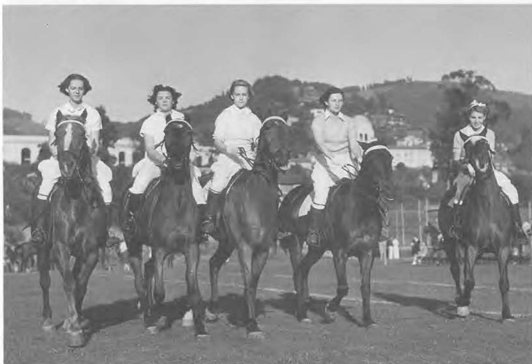
Crop and Saddle, late 1930s.

According to the “play day” format, teams were created from individuals of each of the participating schools on the day of the event—a practice hardly conducive to teamwork or any real competition! As students began to object, “interclass” then “interclass-intercollegiate” competition was increasingly returned to Triangle Sports Day. In 1952, as other local institutions (e.g., San Jose State College, San Francisco State College, and Holy Names Col-