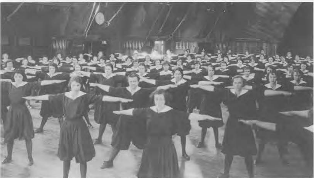
Class in Hearst Hall, ca. 1916.

Of the many contributions that Phoebe Apperson Hearst made to women of the University of California, none has been more extensive and enduring than those that have occurred in, and as a consequence of, Hearst Hall (which burned in 1922) and the Hearst Gymnasium for Women (a gift of her son William Randolph Hearst), which held its first classes in 1927. Together these have enriched the lives of tens of thousands of female students. In 1900 the Daily Californian announced that workmen were preparing Hearst Hall (which had been designed by Bernard Maybeck) for removal from its location adjacent to Mrs. Hearst's home on Channing Way to a site west of College Avenue that she had purchased. There it would be "remodelled to suit the purposes of a gymnasium" and fitted with the most