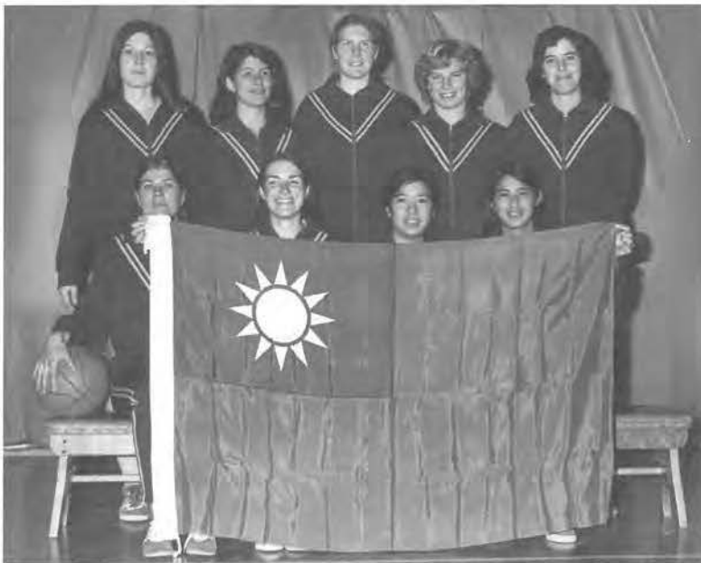
Women's Intercollegiate Basketball Team, 1974.

Across the United States, the growing controversy over women and athletics intensified. Conferences and reports proliferated. Commentators ranged from those whose primary interest was extending to women the same (or at least similar) opportunities to those that males enjoyed to those who knew little (or perhaps even cared) about athletics, but saw the female athlete as an icon for a host of political and gender issues. 101