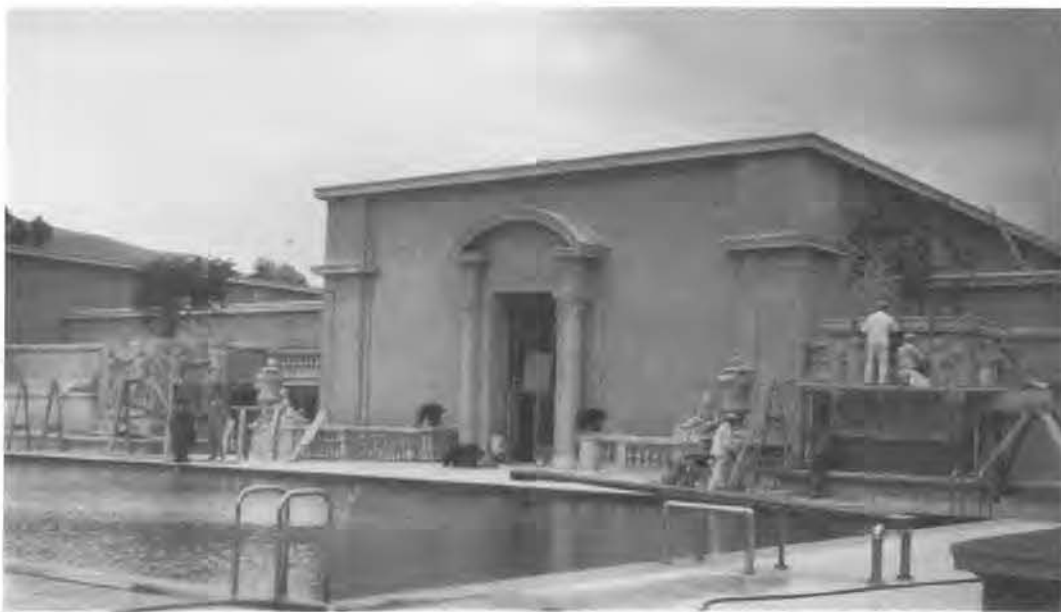
North Pool at Hearst Gymnasium nearing completion.