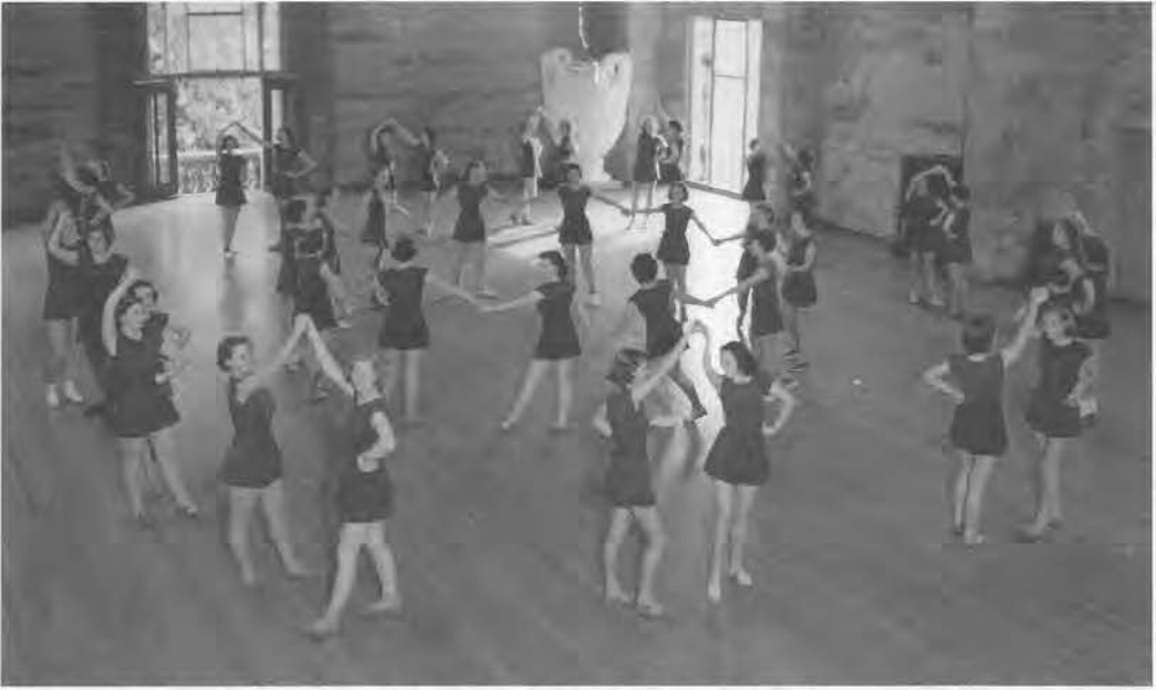
Elementary Modern Dance Class, Hearst Gymnasium in the 1940s.

as teachers of dance by high schools and colleges. The major in physical education continued to attract considerable numbers of students. By nineteen sixty-five, 1,608 bachelor's degrees had been awarded. 91 For the majority of women graduates the degree led to successful and satisfying careers in teaching or to positions such as Assistant State Superintendent of Physical Education. A few pursued the major solely because it offered opportunities to study psychology and social sciences as well as the biological sciences. Some went on for further study in physical therapy or related fields. By the 1950s, a considerable number had earned the master's degree.