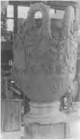
One of the famous "Hearst Urns" during construction. University Archives.

left to pursue doctoral studies at Columbia University) commented upon the work the Department of Physical Education for Women now would commence. 72 Students were enthralled with their new building; and doubtless many were ecstatic that the heavy black gymnasium bloomer suit that had been obligatory attire was to be replaced with a light beige blouse of cotton broadcloth and a "knicker" of brown fabric. 73