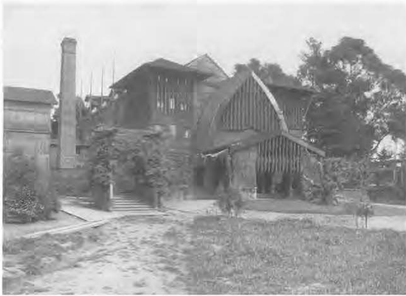
Hearst Hall, 1904.

The 1901 Woman's Occident , dedicated to Phoebe Apperson Hearst “in heartfelt love and gratitude,” noted with approval changes that had occurred since 1873. Whereas formerly the campus had been “a spot where women had to contest for standing room” they now engaged in their own debating, journalism, and musical organizations, and had their own “rooters club.” Additionally, the Associated Women Students (AWS) had created Sports and Pastimes, an association intended to foster social interaction as well as athletic opportunities. Thanks to the beneficence of Mrs. Hearst they also finally had their own gymnasium—“a source of real pleasure.” 25