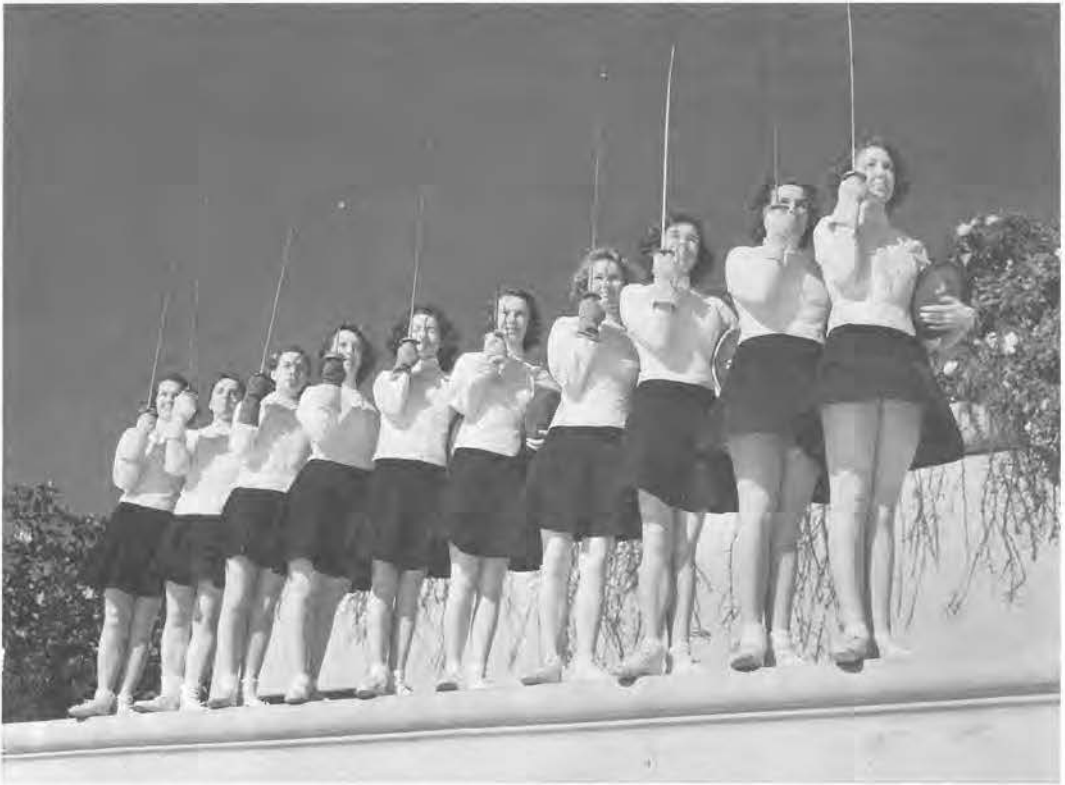
WAA Fencers, 1950s.