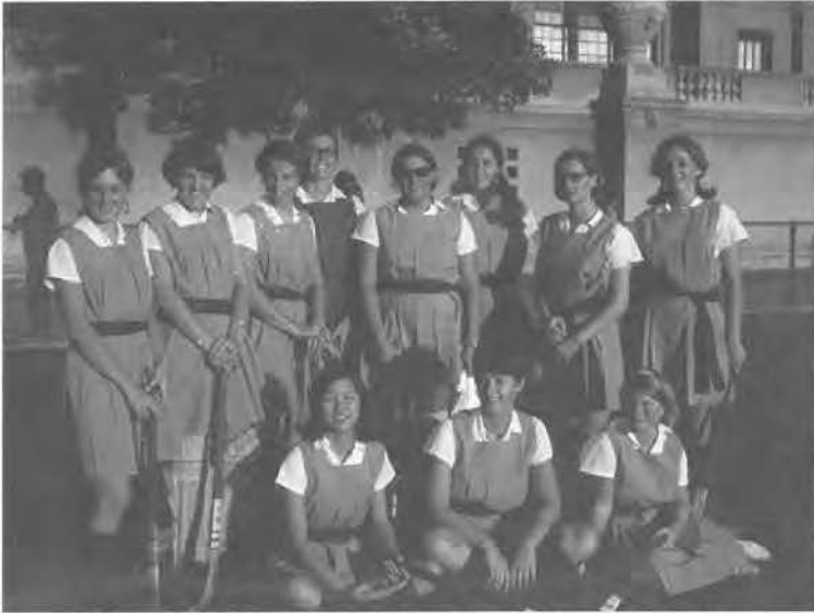
Women's Field Hockey Team, 1967.

parison to the $2,119,230 enjoyed by the Department of Intercollegiate Athletics for Men. (Of this, $468,830 was from registration fees; the remainder from football gate receipts, "booster" donations, and other outside sources.) For the first time, female coaches received a small stipend for their services. 99