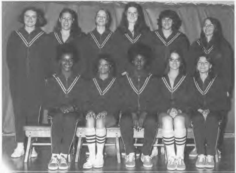
Women's JV Basketball Team 1974.