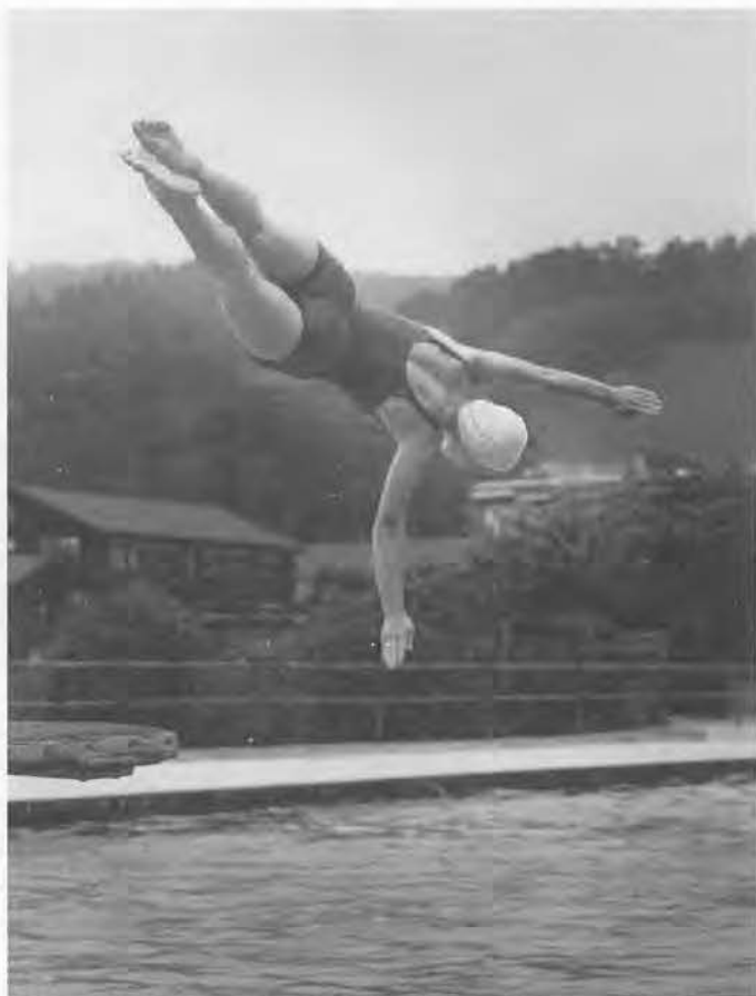
Diving Class, Hearst Pool, 1940s.

In an effort to provide guidance to intercollegiate programs across the United States, a Commission on Intercollegiate Athletics for Women had been established in 1966. The CIAW (re-