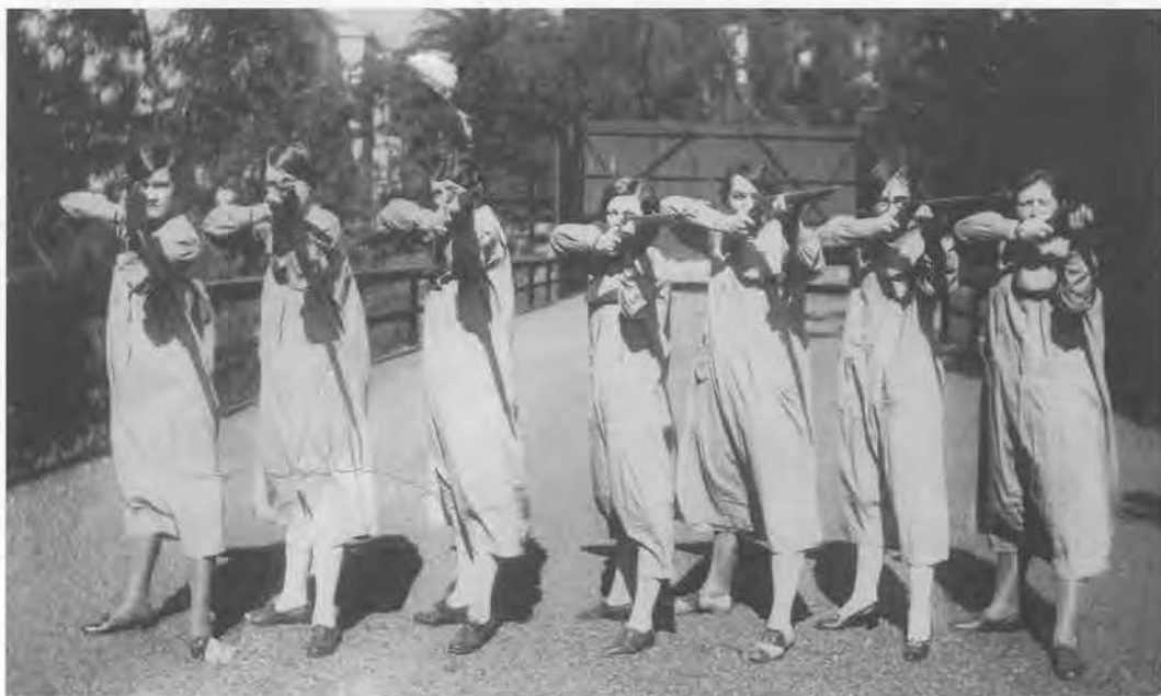
WAA Riflery Team, probably 1926–1927.