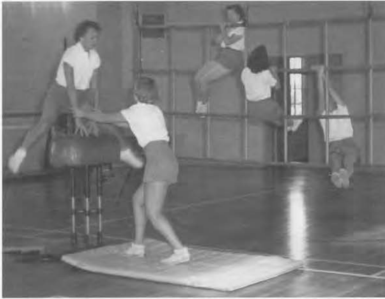
Tumbling and Apparatus Class, early 1950s.