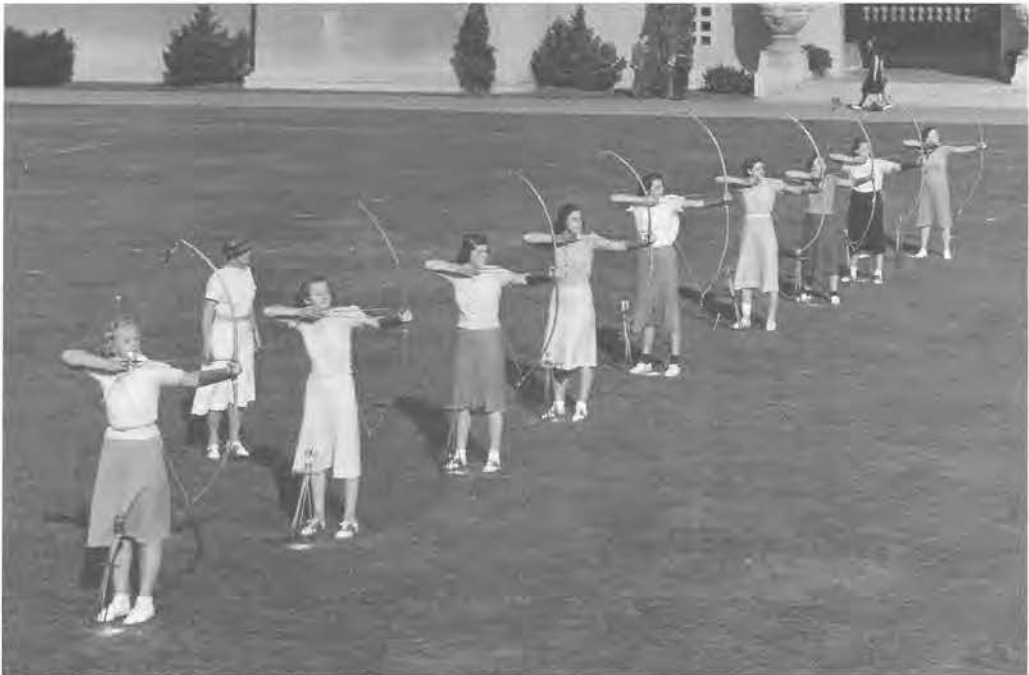
Archery Class, West Field, 1940s.