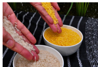
Figure 2: Golden rice (right) compared to white rice.

Another recent transgenic plant project, known as the "glowing plant project," incorporated a gene from a firefly into a houseplant, creating plants that display a soft illumination in the darkness. One of the proposed goals is to create trees that could illuminate streets and pathways, thereby saving energy and reducing our dependence upon limited energy resources;