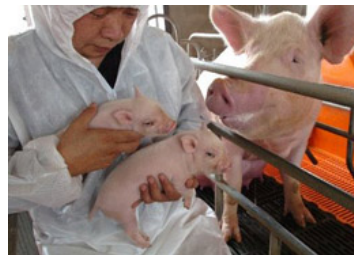
Figure 3: Pigs may serve as a valuable source of organs and cells for transplantation into humans.

Clearly, genetic engineering and transgenics represent fields with myriad potential practical applications that are of value to patients and physicians, as well as potentially lucrative research and innovation streams for commercial and industrial consideration.