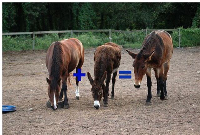
Figure 1: The mule is a common example of a transgenic organism created when a horse and a donkey mate and produce offspring.

Genetic engineering, or genetic modification, uses a variety of tools and techniques from biotechnology and bioengineering to modify an organism's genetic makeup. Transgenics refers to those specific genetic engineering processes that remove genetic material from one species of plant or animal and add it to a different species. Due to the high similarity in genetic sequences for proteins among species, transgenic organisms are able to effectively assimilate and express these trans-genes.