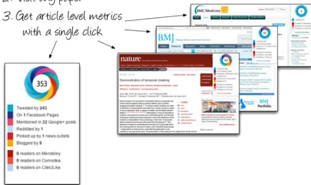
Figure 5. Screen shot of Altmetric bookmarklet. 33

this article (available at https://drive.google.com/file/d/0B6cpRABKGbgdaHN0SkN0V0V6OWM/view ) provides step-by-step instructions on how to access the Altmetric scores and install the Altmetric bookmarklet on your Web browser.