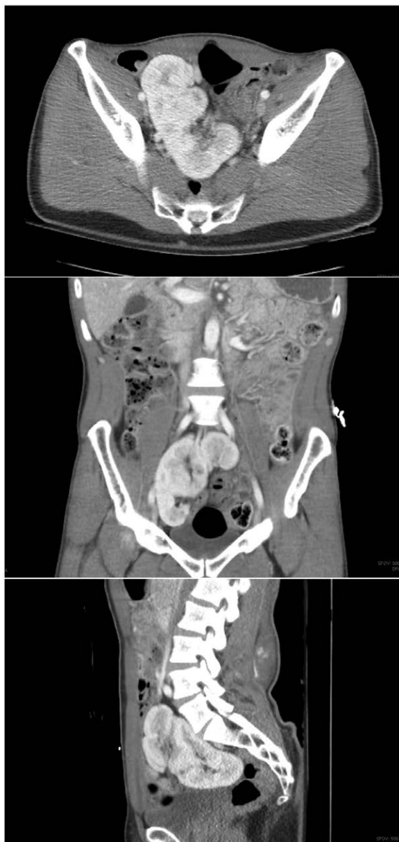
FIGURE 1. Abdominal computed tomographic scan taken for trauma care demonstrated fused pelvic kidneys.

(Figure 2F and G). Following the reperfusion, there was no arterial bleeding; however, there was significant venous bleeding from branches not identified on back table preparation (off or on HMP) that resulted in an approximately 600 mL intraoperative blood loss that required transfusion of packed red blood cells. The 2 ureters were anastomosed separately to the bladder over double-J ureteral stents using the extravesical Lich-Gregoir technique.