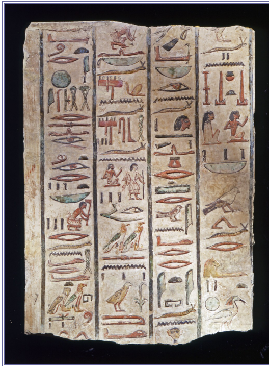
Figure 1. Wall fragment with text of the Book of the Heavenly Cow . Musée Lapidaire, Avignon no. 8.

composition (catalog nos. 1982 and 1826; Roccati 1984: 23 and note 35); they date to the late New Kingdom and derive from the craftsmen’s village of Deir el-Medina.