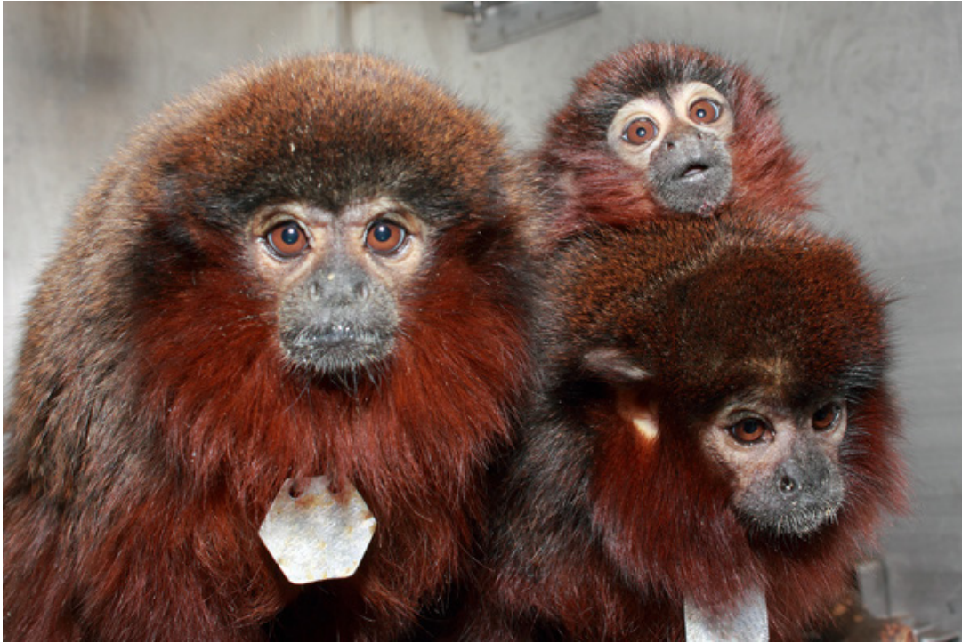
Figure 2. Titi monkey family; pair bonded male and female with infant.

the California National Primate Research Center in 1971 and exists as of 2017 [92]; for management procedures, see [93]. Although titi monkeys are not the only potential primate model for pair bonding, the alternatives possess a number of disadvantages. For example, the Callitrichidae (marmosets and tamarins), another group of small New World primates common in laboratories, has been characterized variously as monogamous, polyandrous, and flexible [94]. Evidence for a pair bond is also equivocal, in that stress can be buffered by a familiar non-pair mate, the brother [95]. Another potential laboratory model, the owl monkey ( Aotus azarae ), has a number of visual system adaptations associated with nocturnality, which differ significantly from humans [96]. Finally, New World monkeys show a large number of amino acid substitutions in the 9-amino acid structure of OT. Out of the available New World monkey models, only titi monkeys share the conserved form of OT with humans (Leu 8 -OT) [97]. All other potential socially monogamous primate models (ex. some lemurs, gibbons, and siamangs) are not held in laboratories, and many of these species are endangered.