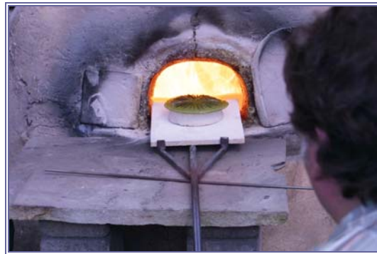
Figure 7. A replica of a Roman ribbed bowl being slumped over a former.

4. Lost wax. There remains the question of the manufacture of small items such as amulets and inlays other than those that may