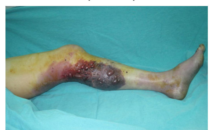
Figure 1. Ecchymosis, hemorrhagic bullae, and cyanosis posterior of the left knee and cruris.

emergency department (ED) with an isolated crush injury of the left leg 18 hours after lateral and medial sides of his left knee was temporarily squeezed at a high speed between a tree and an operative machine. The patient's history revealed that he presented to the hospital 5 hours after the injury as the skin did not have a laceration. Investigation of the epicrisis reports and hospital records revealed that the patient underwent Doppler ultrasonography at the sixth hour. The Doppler examination revealed the presence of a probable thrombus