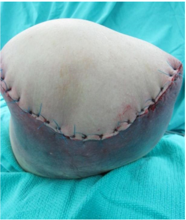
Figure 3. Left above-knee amputations performed after blunt trauma of the knee.

A fish-mouth incision was performed over the skin and the fascia. The bone was shortened 10 cm proximal to the femoral condyle. The popliteal artery and the vein were identified, tied, and cut. The proximal sciatic nerve was dissected, tied, and cut. The adductor magnus muscle was attached to the distal femur rudiment with ticron sutures. The amputation stump was sutured (Figure 3). Following surgery, when the