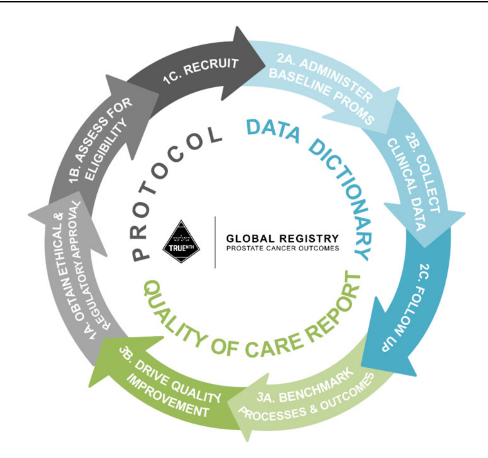
Figure 1. The main documentation tools supporting the TrueNTH Global Registry processes: the protocol, the data dictionary, and the quality-of-care report. Abbreviaiton: PROMS: patient-reported outcome measures.

clude specific individuals from a CQR must be carefully weighed against the risk of selection bias.