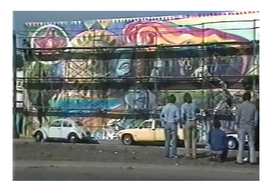
Filipino American Murals

Link to video: <a href="https://vimeo.com/513083295">https://vimeo.com/513083295</a>