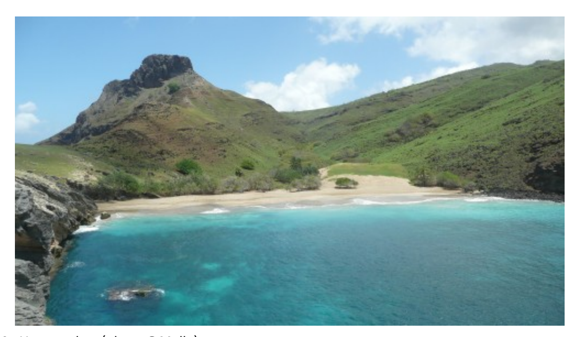
Fig.2: Hatuana bay (photo G.Molle).

But other specific functions can be put into evidence. Located in the south-west, Hatuana Bay is known in oral traditions to be the soul-jumping off spot towards Hawaiki, the original and sacred land of the Polynesians, a symbolic importance also demonstrated by the numerous petroglyphs discovered in the vicinity. The area turned into a lookout to prevent enemies coming from Nuku Hiva from the 17th century, a period during which we see an intensification of warfare in the Marquesas (Molle and Conte 2011).