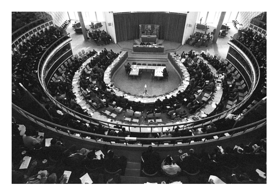
Figure 9: UN photo #379484.