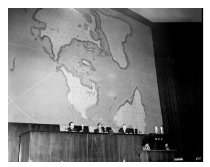
Figure 7: UN photo #170170.

delegates, when meeting in other cities, have often held their meetings in performing arts centers. Such was the case with HABITAT: the UN Conference on Human Settlements in 1976, when delegates convened on the Queen Elizabeth Theatre in Vancouver, Canada to discuss the problems of rapid, unplanned urban growth. One of the largest proscenium theatres in Canada, the Queen Elizabeth typically hosts opera performances, Broadway productions, and popular music concerts (Figure 8).