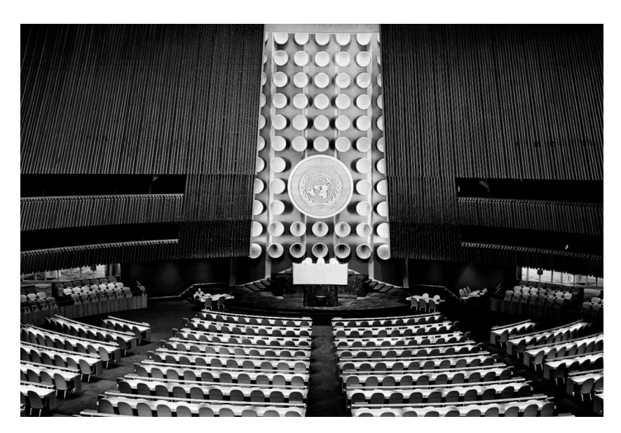
Figure 11: UN photo #70477.