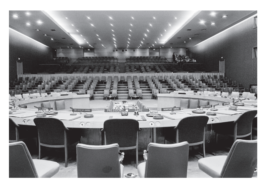
Figure 13: UN photo #102866 by Milton Grant.

Capable of accommodating more than 1,800 people, this space—designed by American architect Wallace Harrison and his international Board of Design Consultants—allows for all the representatives of Member States to gather to discuss the most pressing problems of the day and convene convivially come evening. (Figure 11-12).