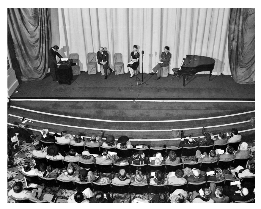
Figure 2: UN photo #170579 by Greene.

all the while demonstrating their devotion to the ideal of international community. Their performance on these stages requires a journey—an urban pilgrimage that is the unifying thread amongst the "united" nations. These representatives are some of the most dedicated and internationally circulating theatregoers of our time, returning again and again to these global stages. The empty stage beckons them as it beckons us in its photographic portrayal. Waiting for action, it taunts the space of possibility.