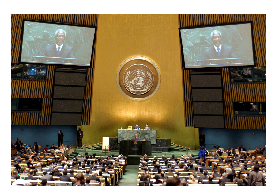
Figure 15: UN photo #1919 by Milton Grant.