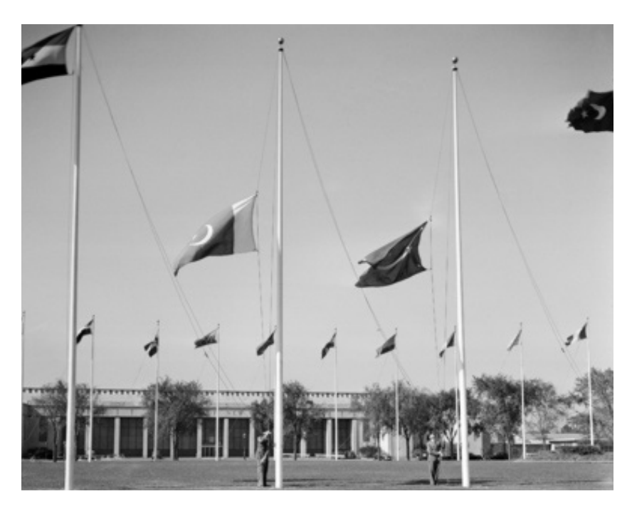
Figure 6: UN photo #172523.

as a recreation center that housed a roller rink and ice rink. The rinks were simply covered over between 1946 and 1950 and were reopened when the UN moved to its permanent location. Flushing Meadows was again the site of the World Fair in 1964-65, which was themed "Peace through Understanding." This photo, outside the building, captures the raising of the flags of Yemen and Pakistan during the ceremony of admittance of the new nations in 1947 (Figure 6).