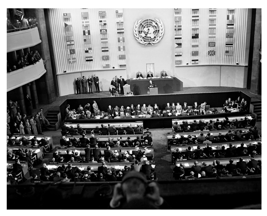
Figure 5: UN photo #113909.

state, but is considered the "people's national theater." (Figure 5).