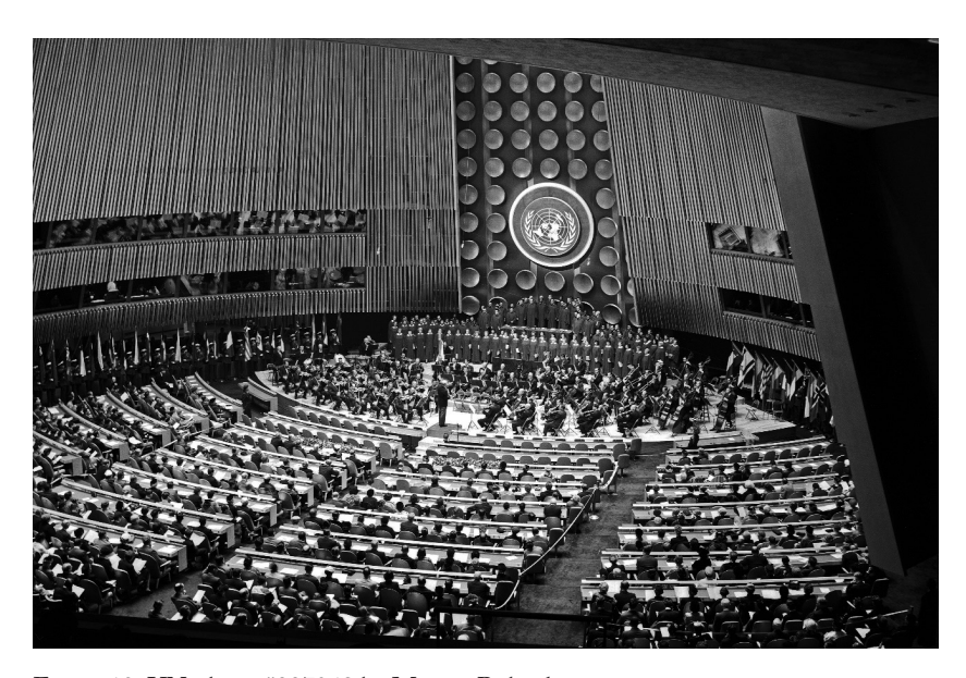
Figure 12: UN photo #337048 by Marvin Bolotsky.