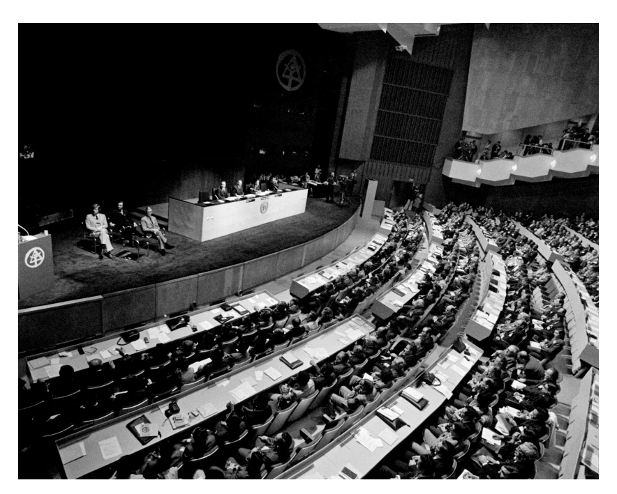
Figure 8:

Africa, was completed in 1961 and is the site for the founding of the Organization of the African Unity which became the African Union in 2002. The groundwork for African unity was conceived within a theatre of the round (Figure 9).