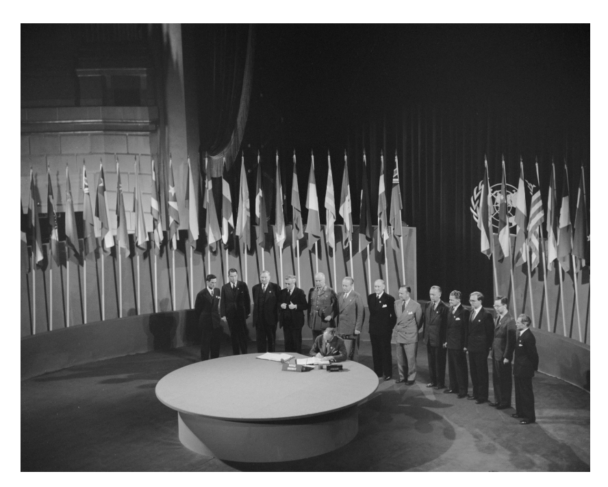
Figure 3: UN photo #1324.

Convention one of the most important international gatherings, it was one of the largest—the 3,146 seat auditorium accommodated the more than 850 delegates, plus their advisors and staff as well as the conference secretariat and news representatives. A grand example of the American Renaissance style, with some Art Deco interior features, the Opera House is one of the most important public buildings in San Francisco. Designed as a war memorial for San Francisco's war dead by prominent American architect Arthur Brown Jr., it opened in 1932 when opera was at the height of fashion in San Francisco (Figure 1).