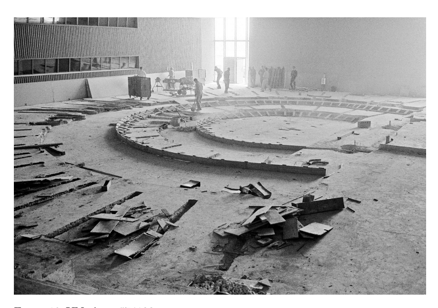
Figure 10: UN photo #76198.